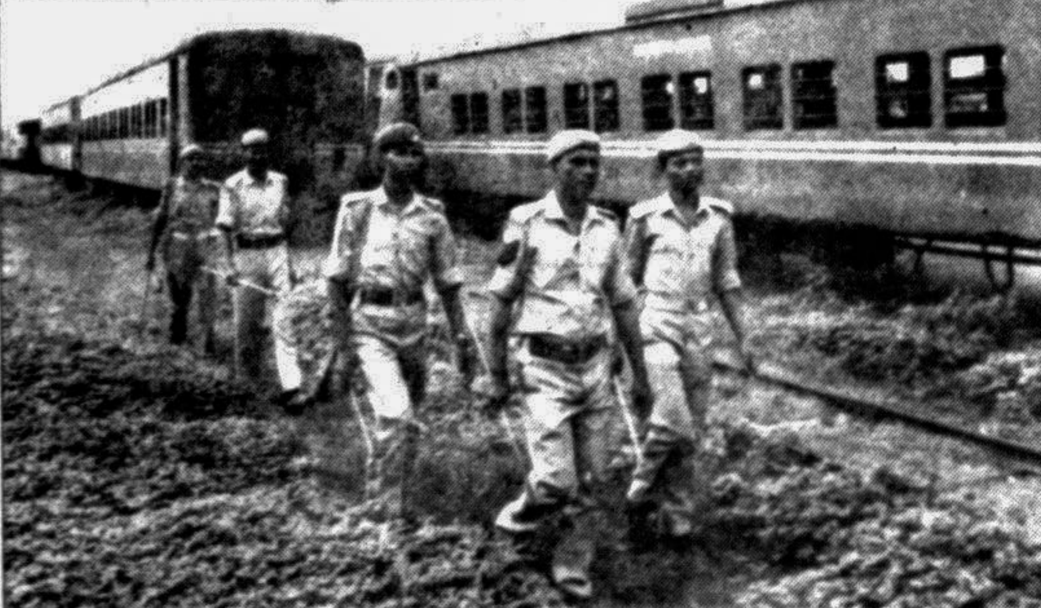
Policemen armed with batons seen on patrol at the Kamalapur Railway Station in the city following the killing of an on duty Ansar recently.

The areas also include: From the connecting point of the Agargaon Link Road and Rokeya Sarani to Parjatan Sarani through Bijoy Sarani, from the eastern part of the Indira Road to the western part of Mantik Mia Avenue, the protected area of the Parliament House and its all roads and lanes.