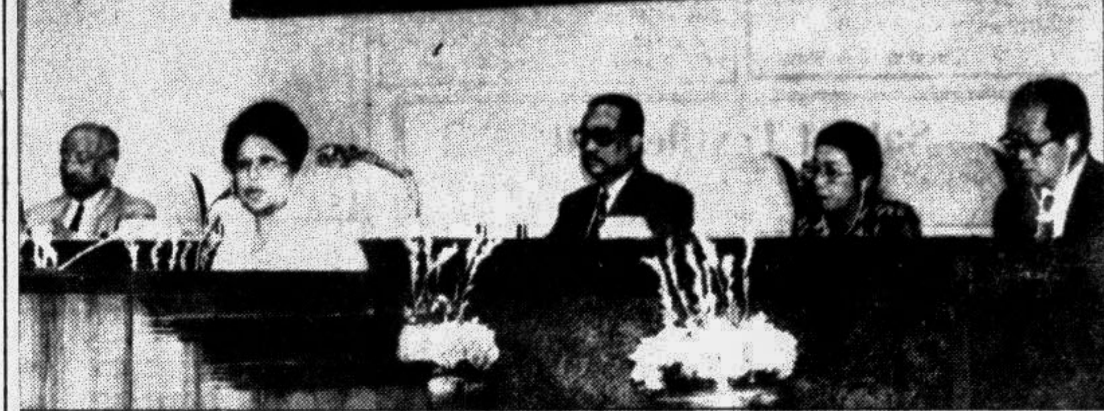
Prime Minister Begum Khaleda Zia addressing the inaugural session of the Intergovernmental Consultative Committee on regional space application programme for sustainable development in Asia and the Pacific at the International Conference Centre in the city yesterday.