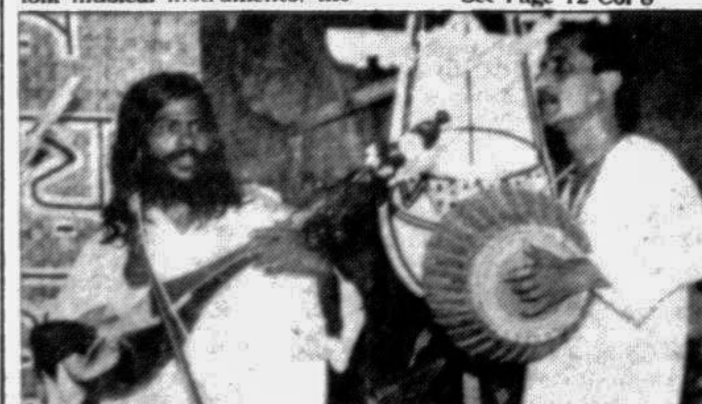
Two bauls (folk singers) performing at the Ramna batamul in the city on the first day of the three-day national festival yesterday.