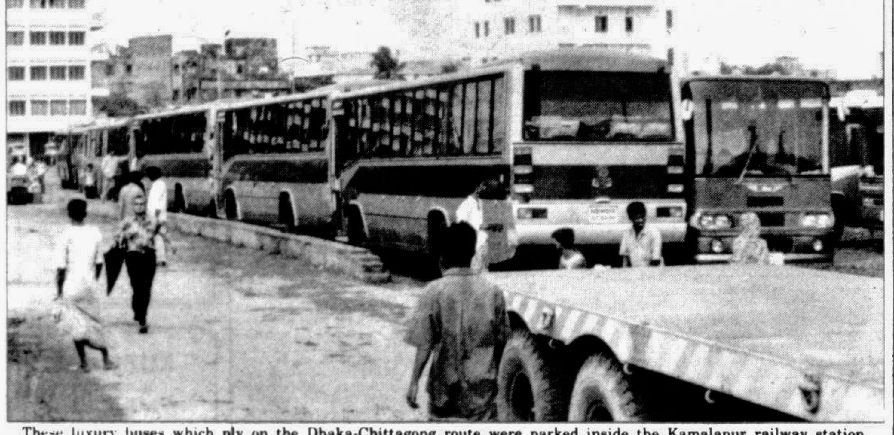
These luxury buses which ply on the Dhaka-Chittagong route were parked inside the Kamalapur railway station compound yesterday after their removal from the Fakirerpool area Sunday last.