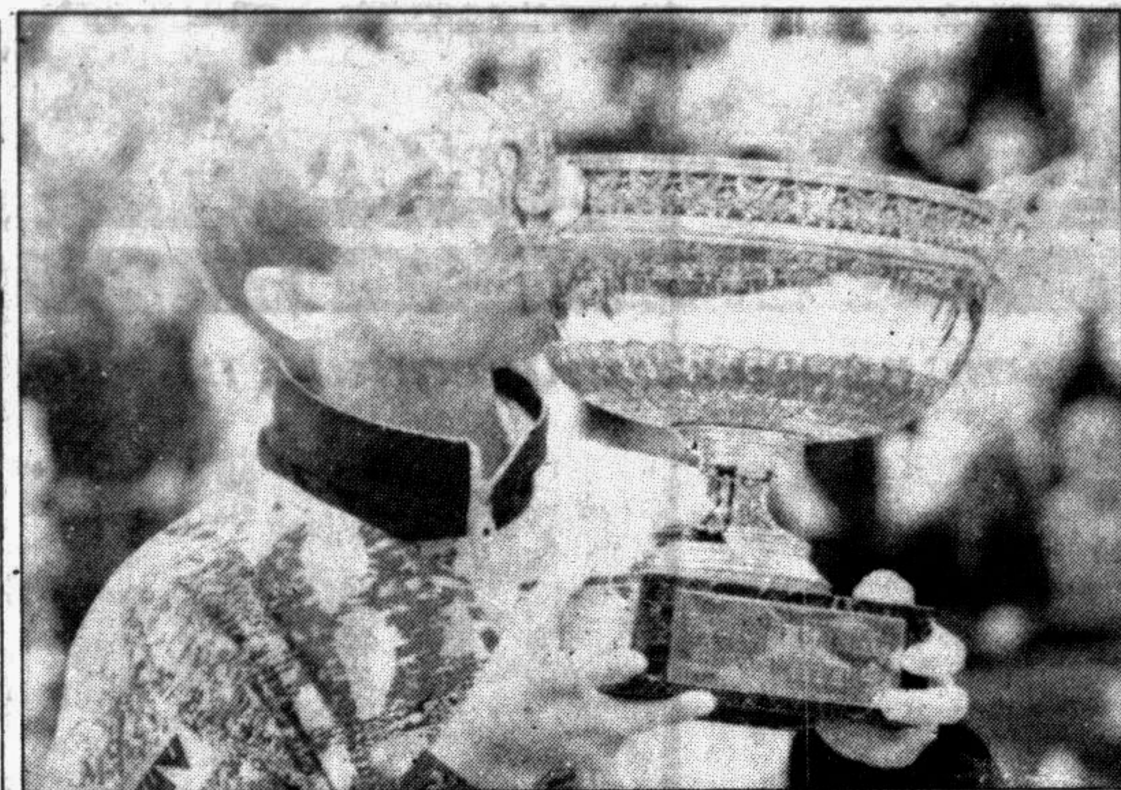
Austrian Thomas Muster kisses the French Open trophy after defeating American Michael Chang in the men's singles final at Roland Garros on Sunday. Muster won 7-5, 6-2, 6-4.