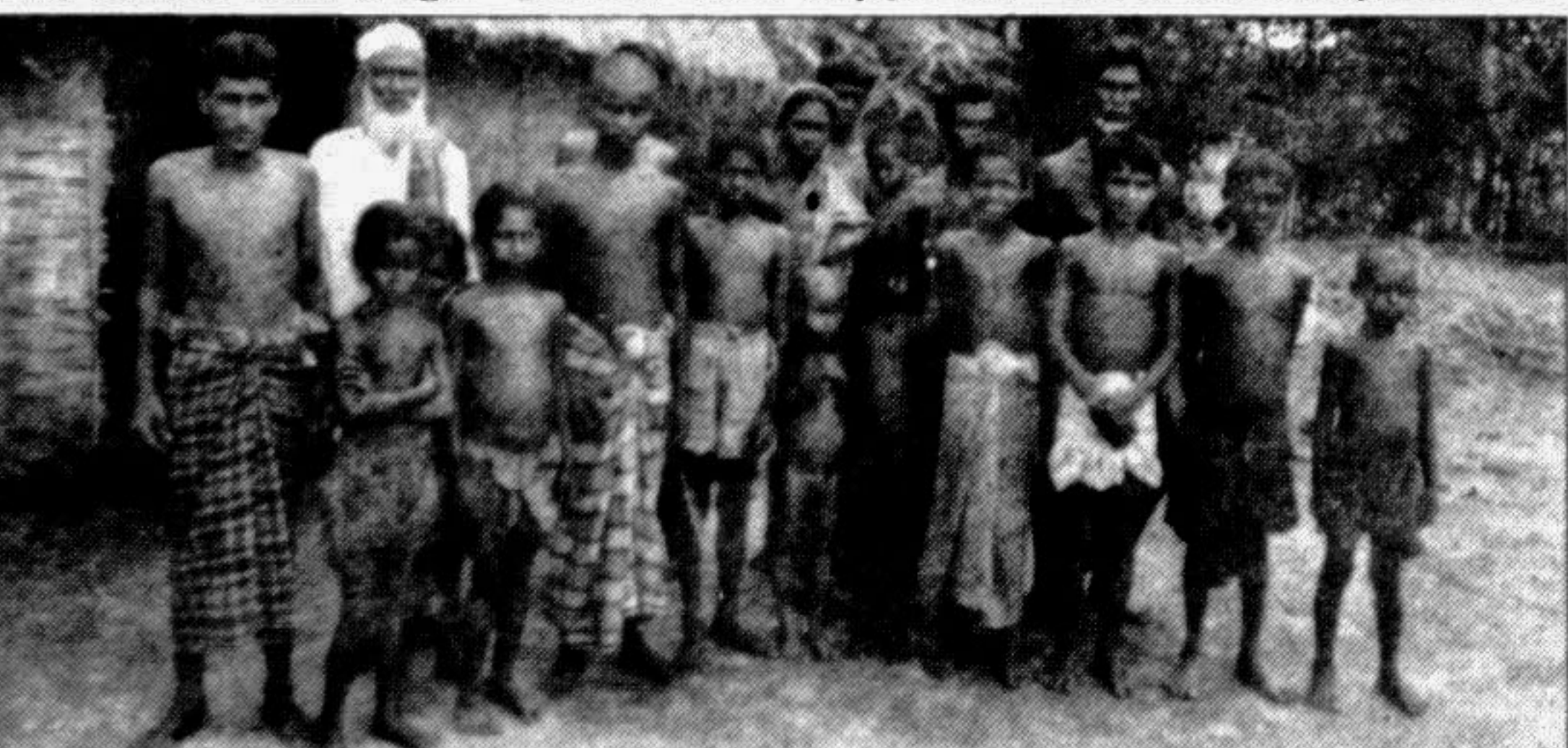
SYLHET: Some malaria affected patients of village Naranpara of Rangarchar union of Sunamganj sadar thana.

It is widely felt that, government agencies welfare organisations, NGOs and well-to-do people of the society should come forward to provide these poor people with nutritious food, pesticide and mosquito nets.