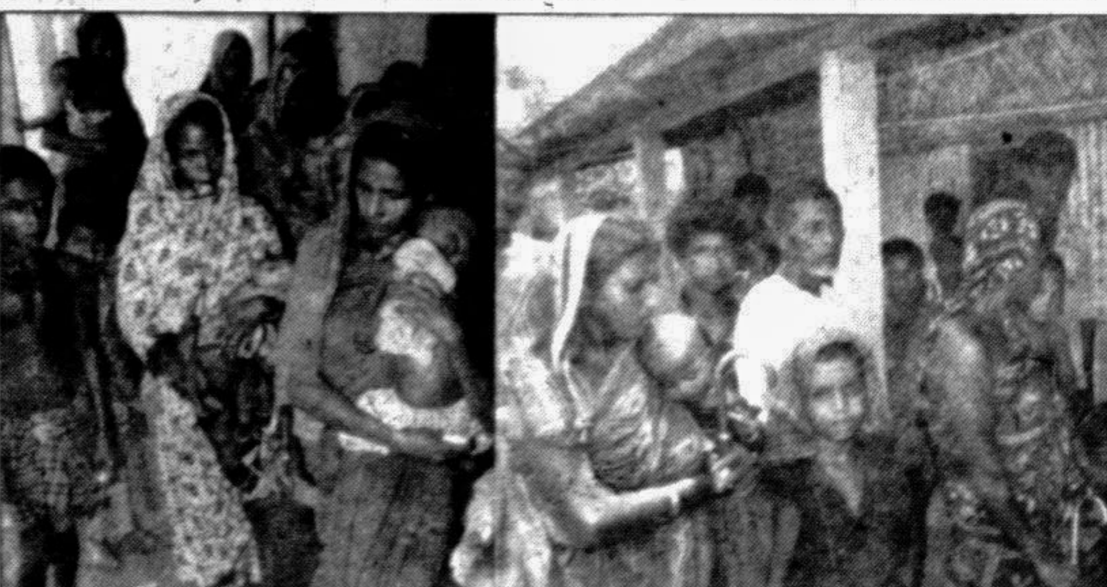
SYLHET: Malaria patients crowd a temporary medical camp at Rangarchar union of Sunamganj sadar thana.

member Muksed Ali said, at least one hundred to 150 people are being attacked by the disease everyday. It is not possible to save the people except immediate arrangement for distribution of pesticide and distribute mosquito nets. Large-scale spraying of DDT should also be launched im-