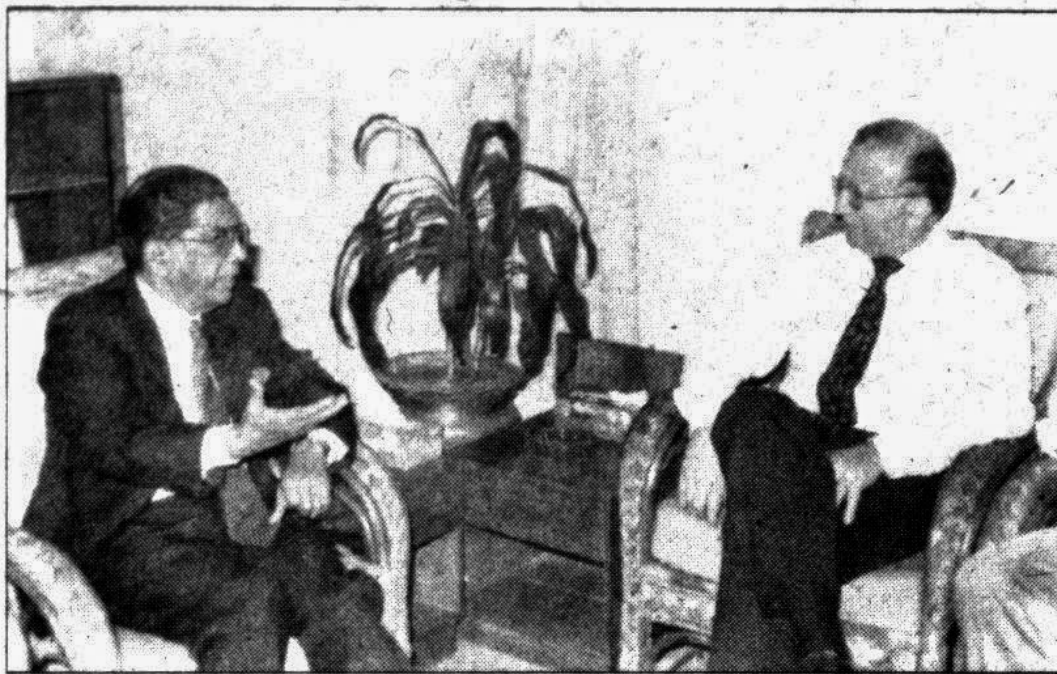
The visiting German Christian Democratic Party MP Willy Wimmer (R) called on Commerce and Information Minister M Shamsul Islam at the latter's office in the city yesterday.