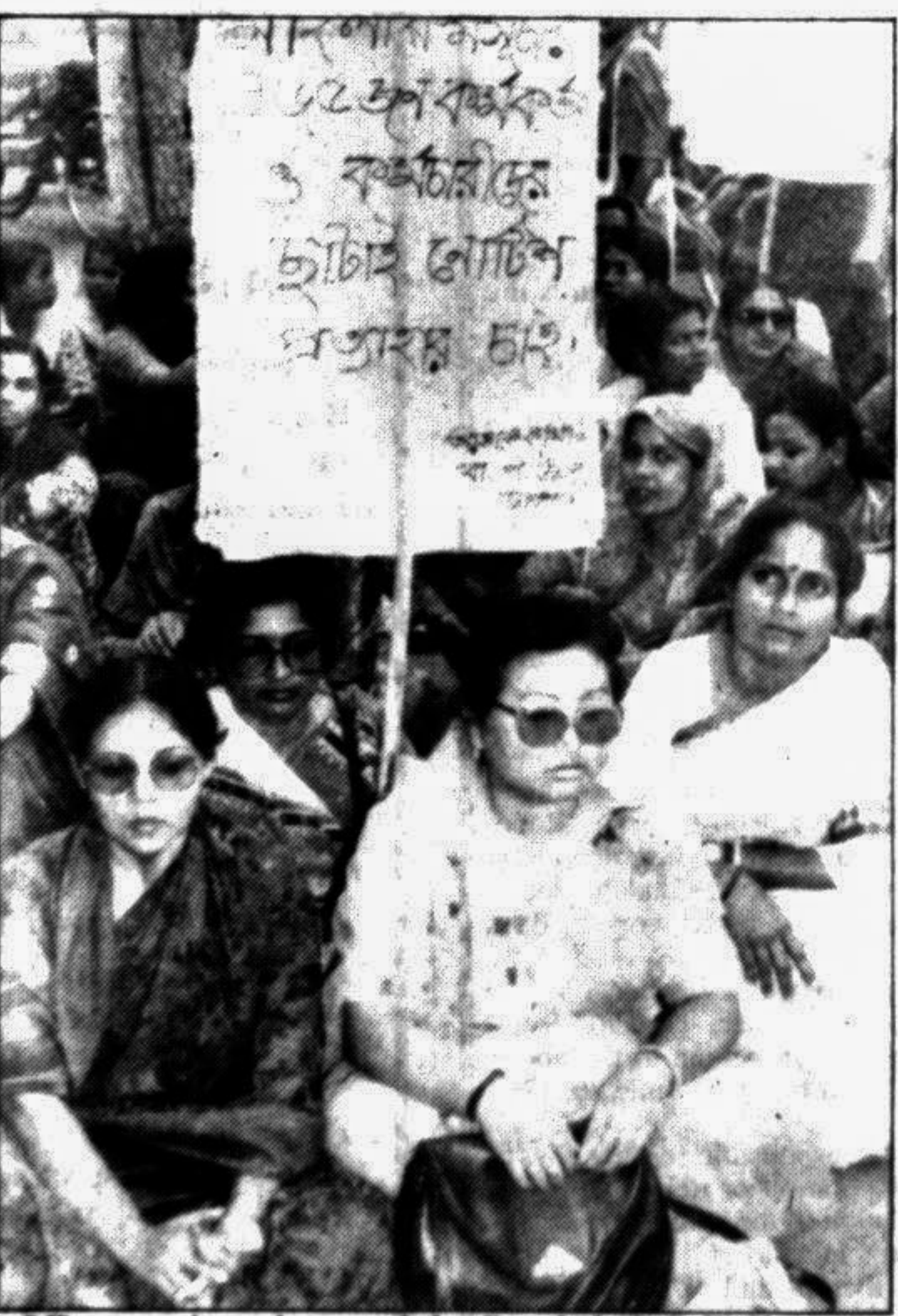
Officers and employees of the Bangladesh Pali Unnayan Board staged a demonstration in front of the Secretariat yesterday demanding immediate withdrawal of the retrenchment of 765 employees.