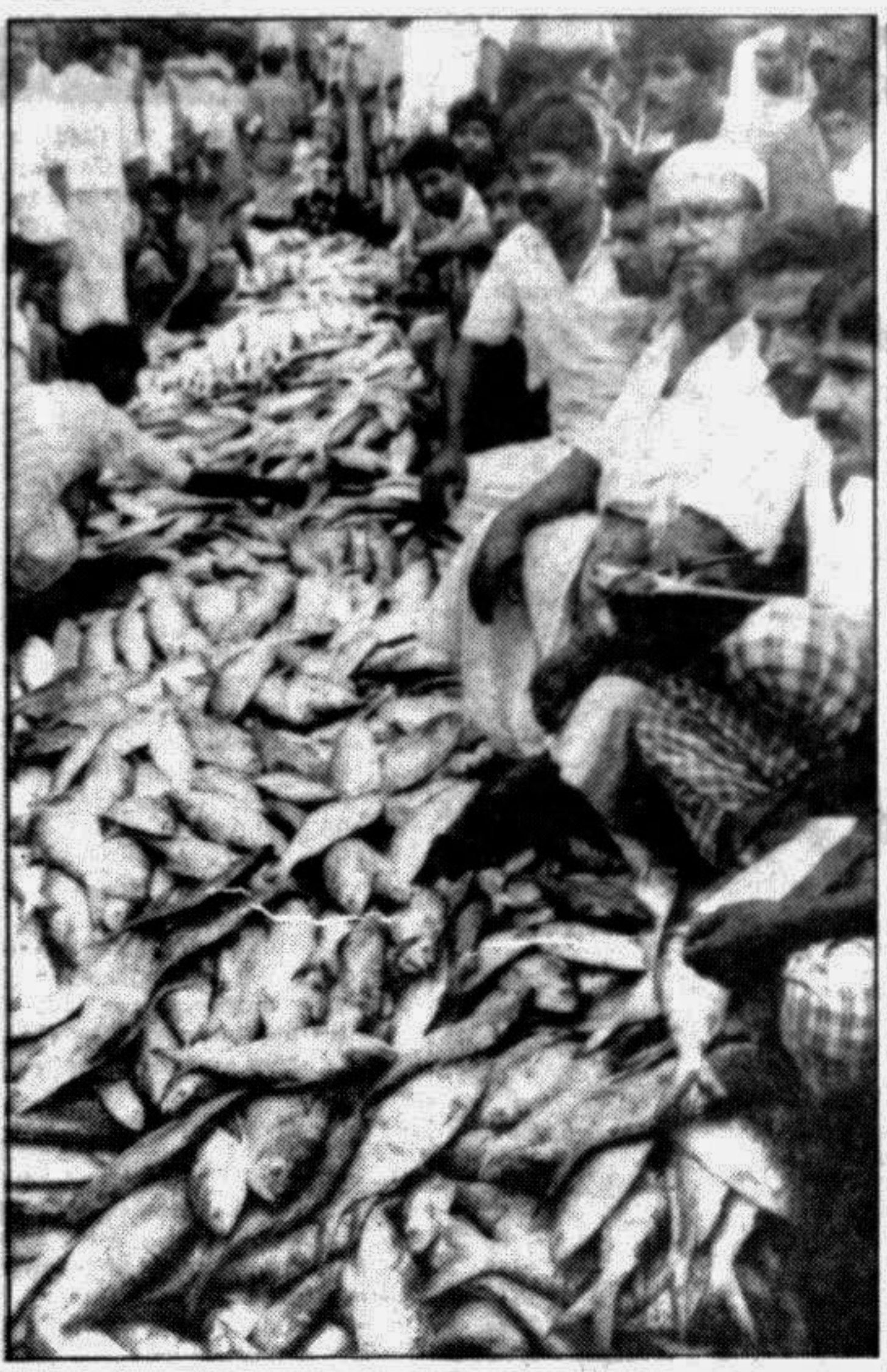
Despite abundant supply of Hilsa in the city markets the prices of this delicious fish remain high.