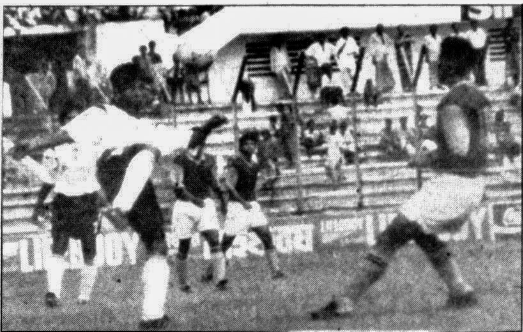
A midfield action from yesterday's Beximco 13th Federation Cup football tournament engagement between Mohammedan Sporting Club and Rahmatganj Muslim Friends Society at the Dhaka Stadium. Mohammedans sauntered into the semifinals with a comfortable 3-0 win.