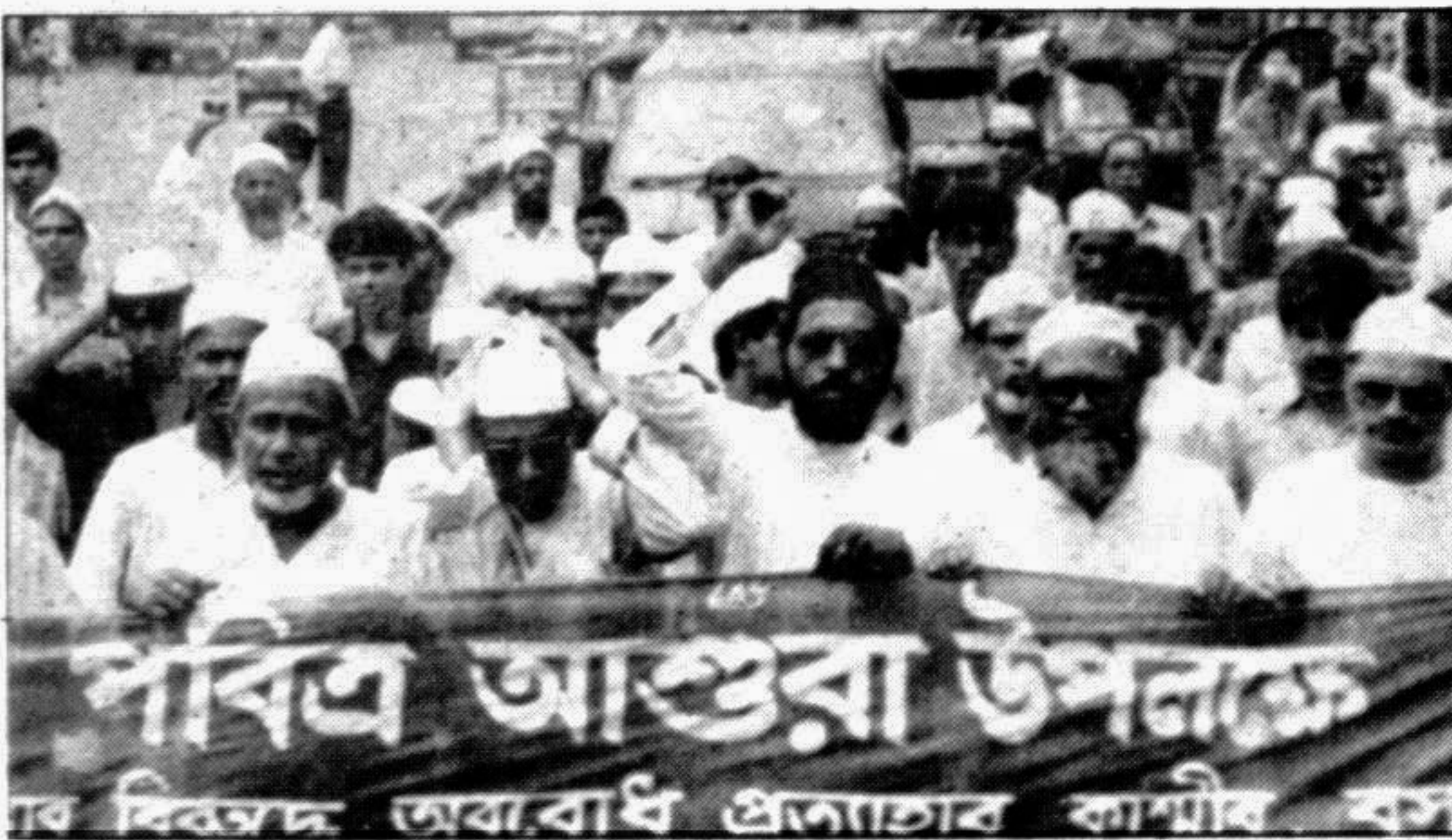
A procession was brought out in the city on the eve of the Holy Ashura.

They also appreciated the improvement of law and order situation in the areas.