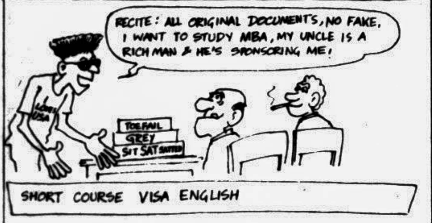
SHORT COURSE VISA ENGLISH