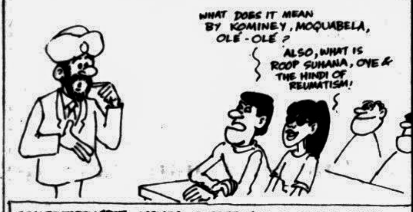
COMPREHENSIVE HINDI COURSE FOR Z & ATN FANS