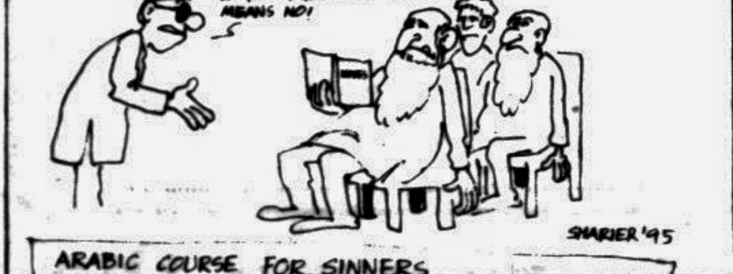
ARABIC COURSE FOR SINNERS

English or in some cases only one of the two. On the other hand, if you are seeking employment overseas and if the US, UK, Australia or other English-speaking nations are not exactly what you have in mind, your knowledge of English might not always be sufficient.