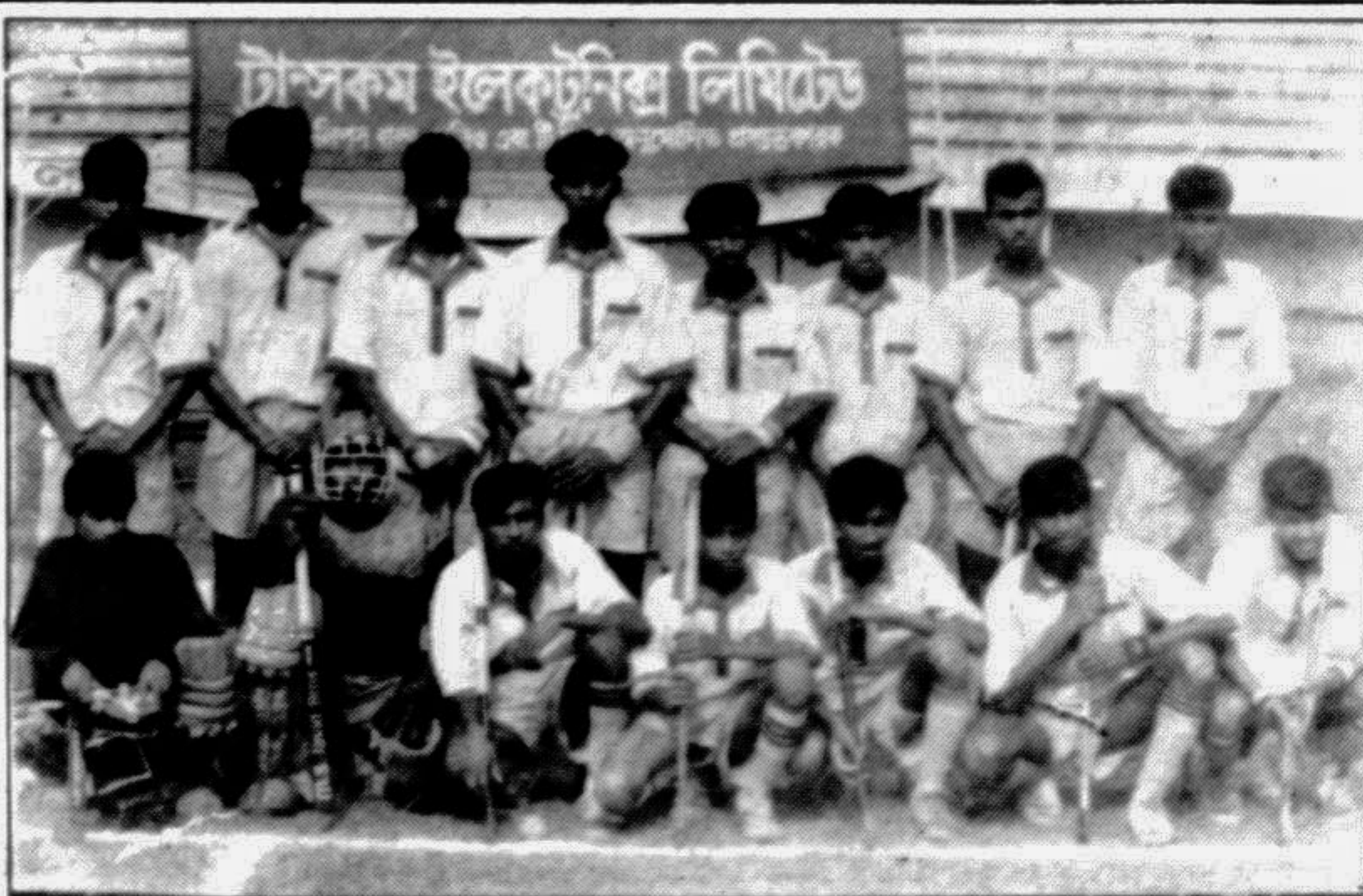
Players of the Rajshahi Medical College Campus High School, who won the Transcom national schools hockey title defeating Mojuddin High School of Faridpur 3-0 in the final at the Hockey Stadium yesterday.

CHANDIGARH, India, June 8: Hosts India drew 1-1 with Canada in the opening match of the Indo-Pan American Friendship Gold Cup hockey tournament on Wednesday in the northern Indian city of Chandigarh, reports Reuter. Other teams participating in the six-day tournament are Pan-American champions Argentina and the United States.