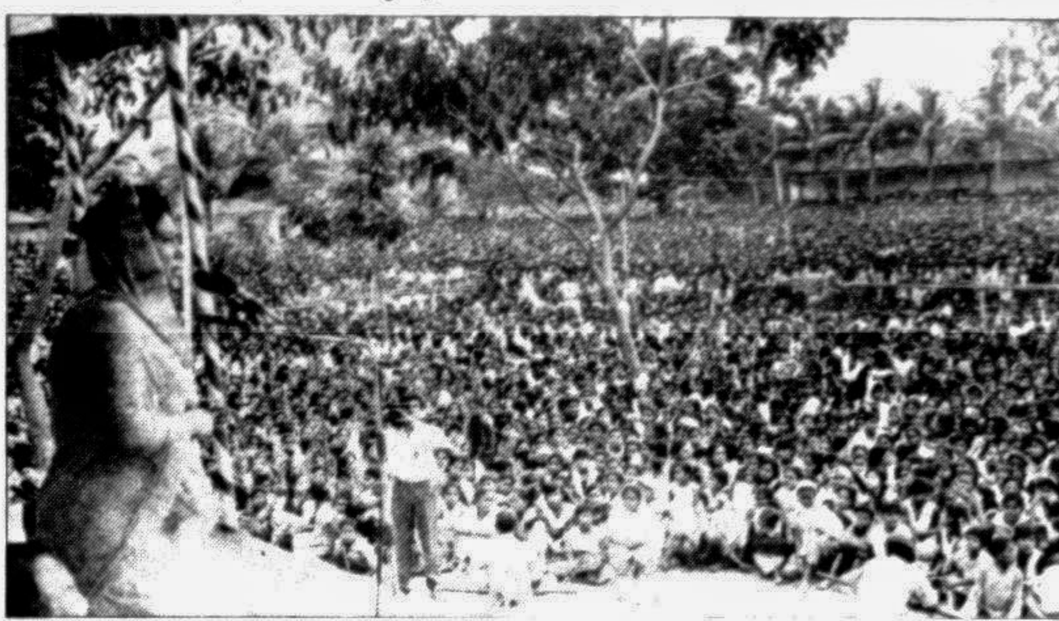
Prime Minister Begum Khaleda Zia addressed a huge public meeting at Gobindaganj in Gaibandha district yesterday.