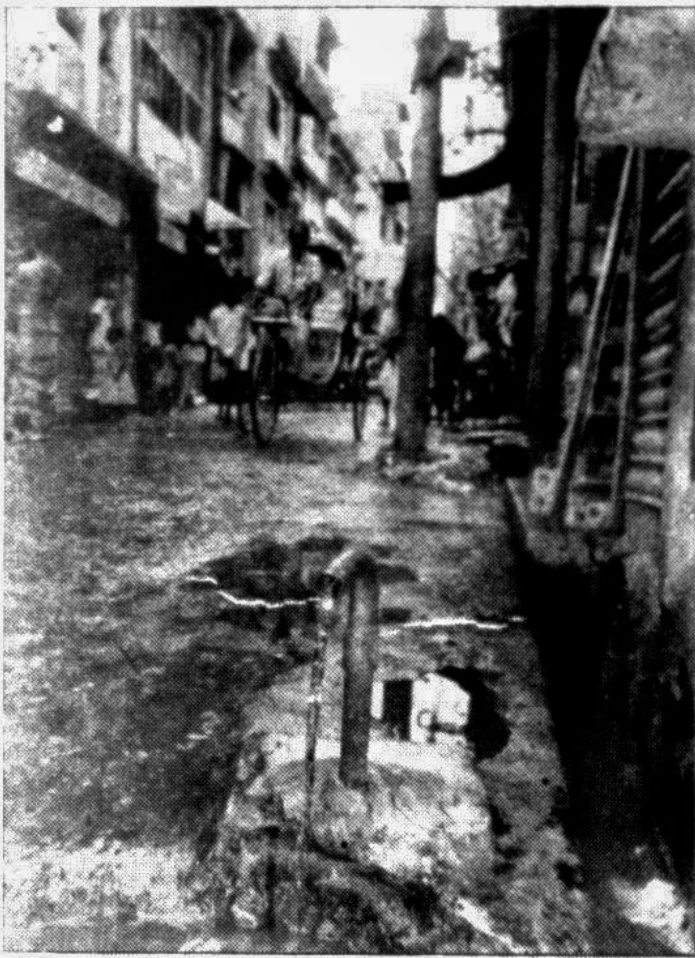
Water gushing out from a public hydrant in Tanti Bazar. Nearly 100 hydrants located in this part of old Dhaka do not have any control caps to stop wastage.