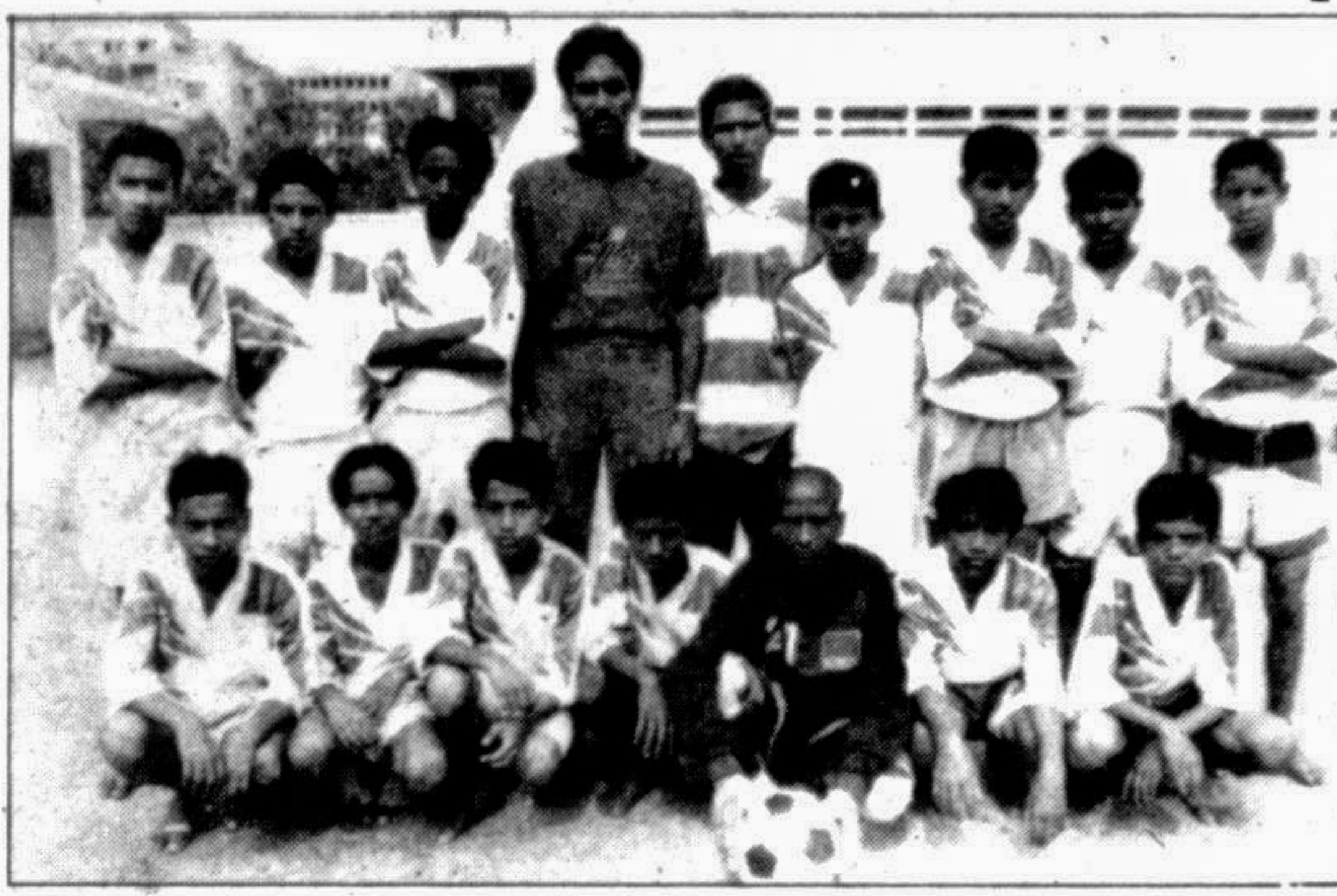
The players and officials of Gopibagh Welfare Association, who clinch the sixth Jadugar Samad juvenile football championship with a 4-2 win over Rising Star in the final at the Outer Stadium yesterday.

Sports Reporter JCT clinched the 19th Federation Cup football tournament title when the South Indian team beat the Calcutta giant East Bengal Club 6-5 in the tie-breaker at the Salt Lake Stadium yesterday.