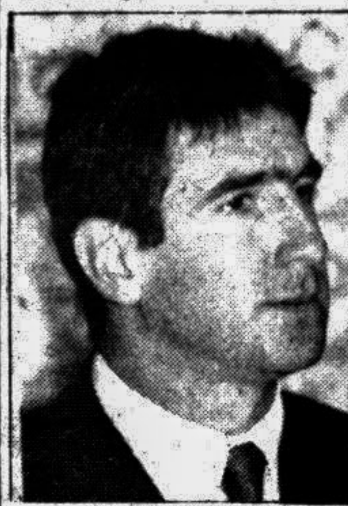
ERIC CANTONA housed elsewhere.

The film is being shot in a beautiful farmhouse, ironically owned by an English couple who have been temporarily