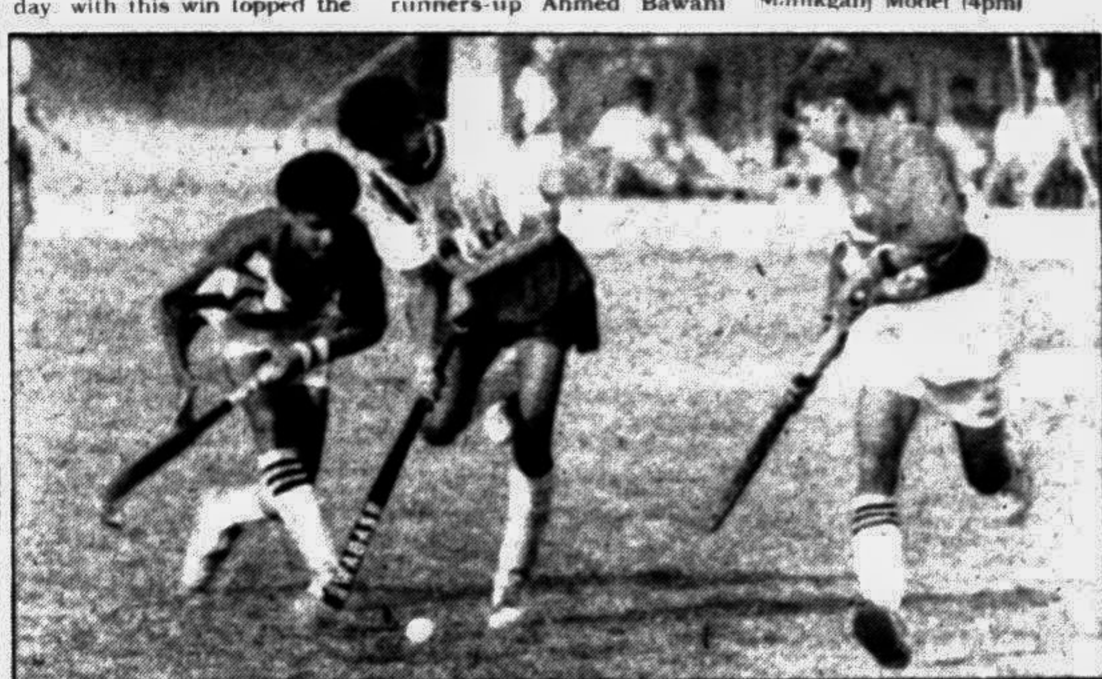
Action from yesterday's Transcom second national schools hockey championship engagement between Ahmed Bawani Academy and Armanitola Govt High School at the Hockey Stadium. Ahmed Bawani won 4-1.

TODAY'S MATCHES Narayanraj Govt. vs Residential Model (2.45pm) RMC Campus School vs Maminiganj Model (4pm)