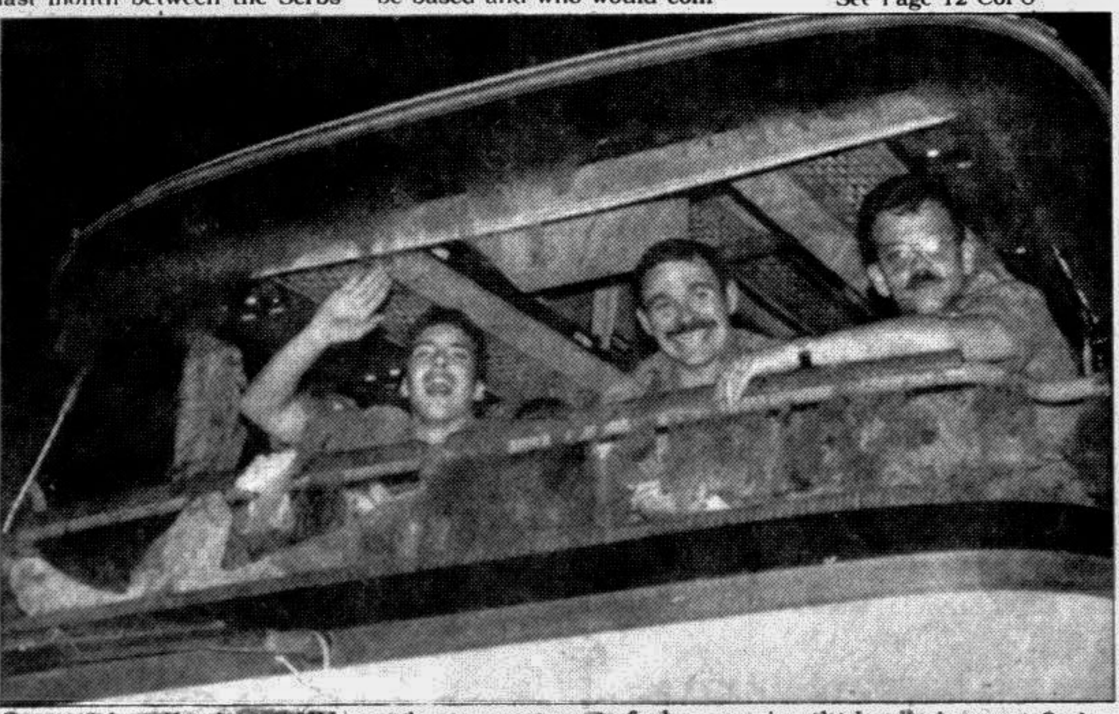
Some of the 121 released UN peacekeepers wave out of a bus crossing the border between Serbia and Bosnia yesterday after being freed by the Bosnian Serbs who had taken them hostage last week.