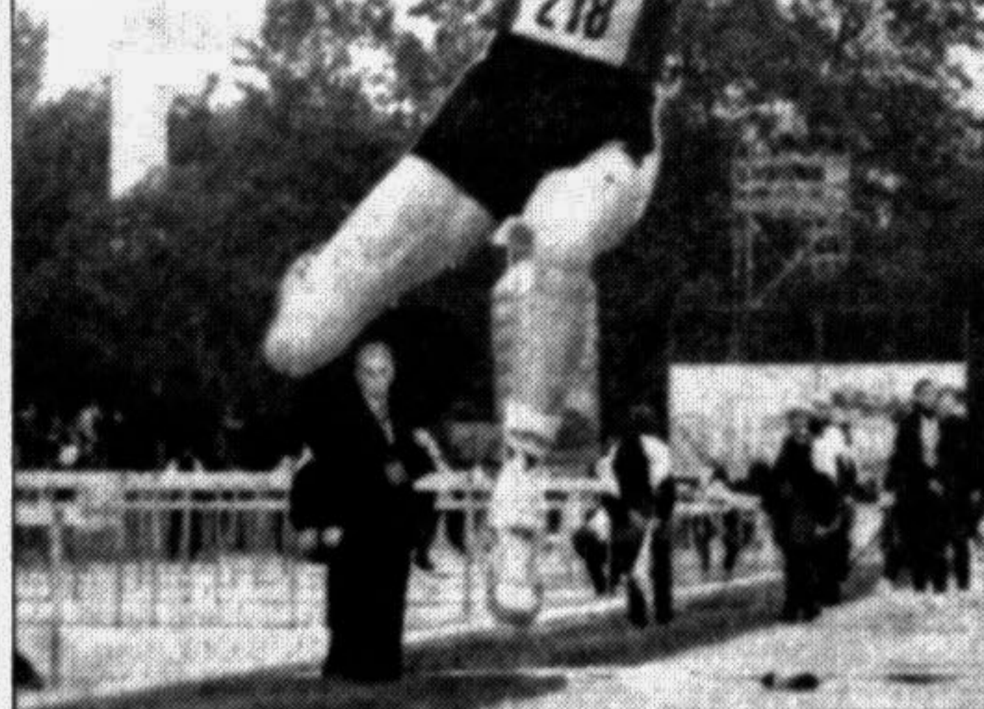
An airborne Heike Dreschler of Germany leaps through the sandpit to win the women's long jump event at an international athletics meeting as heavy rain falls on the Saint Denis Stadium near Paris on Thursday. Dreschler's jump was 6.80 metres.

Elsewhere, American Derrick Adkins beat a world-class field in the 400 metres hurdles to set the best time of the year with 48.11 seconds. Five best marks of 1995 were set at the meeting.