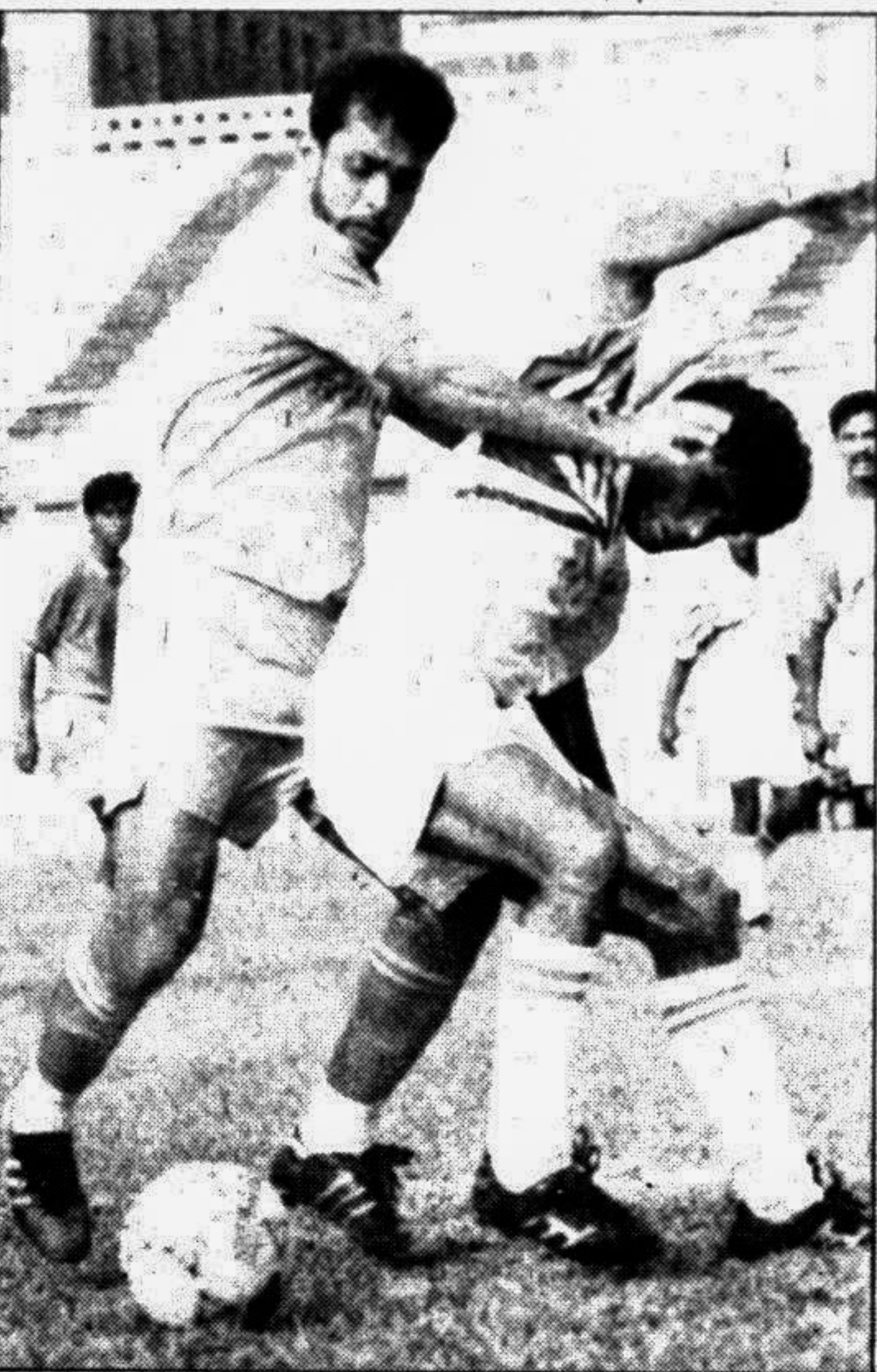
A mid-pitch action between Abahani Krira Chakra of Chittagong and Farashganj Sporting Club in the Beximco 13th Federation Cup football tournament match at the Dhaka Stadium yesterday. Abahani won the match 5-4 in the tie-breaker.

TODAY'S MATCH Bangladesh Boys vs Wari Club (6 pm)