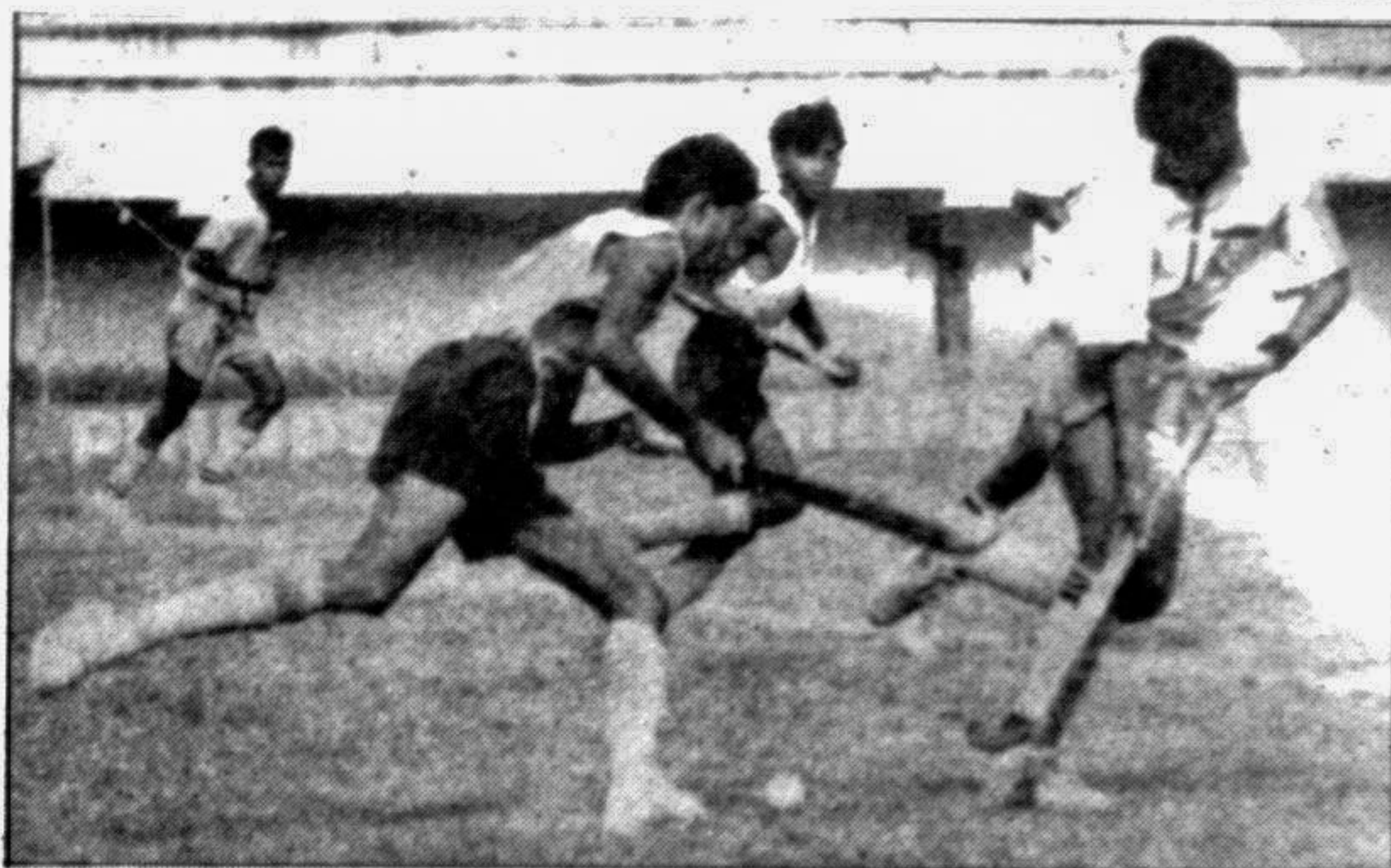
Action from yesterday's match between Rajshahi Medical College Campus Model High School and Ahmed Bawani Academy in the Transcom national schools championship at the Hockey Stadium. Rajshahi won the match by a solitary goal.

FIFA officials said an inspection committee would be ready to begin looking at stadiums and facilities in the two countries by the end of September this year.