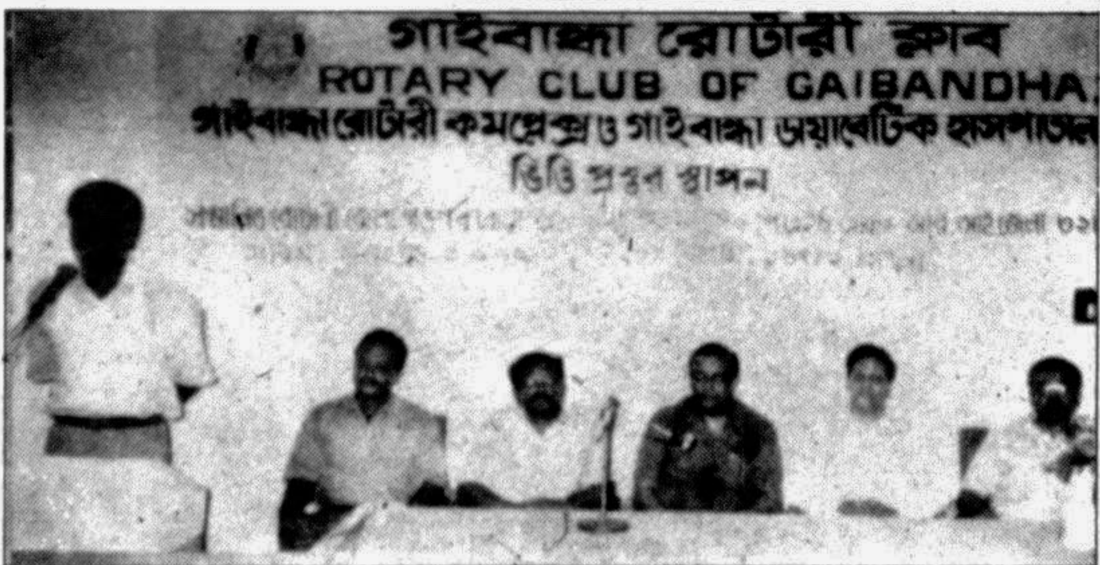
GAIBANDHA: The Foundation laying ceremony of the Gaibandha Diabetic Hospital and Gaibandha Rotary complex was held recently at the local circuit house auditorium.