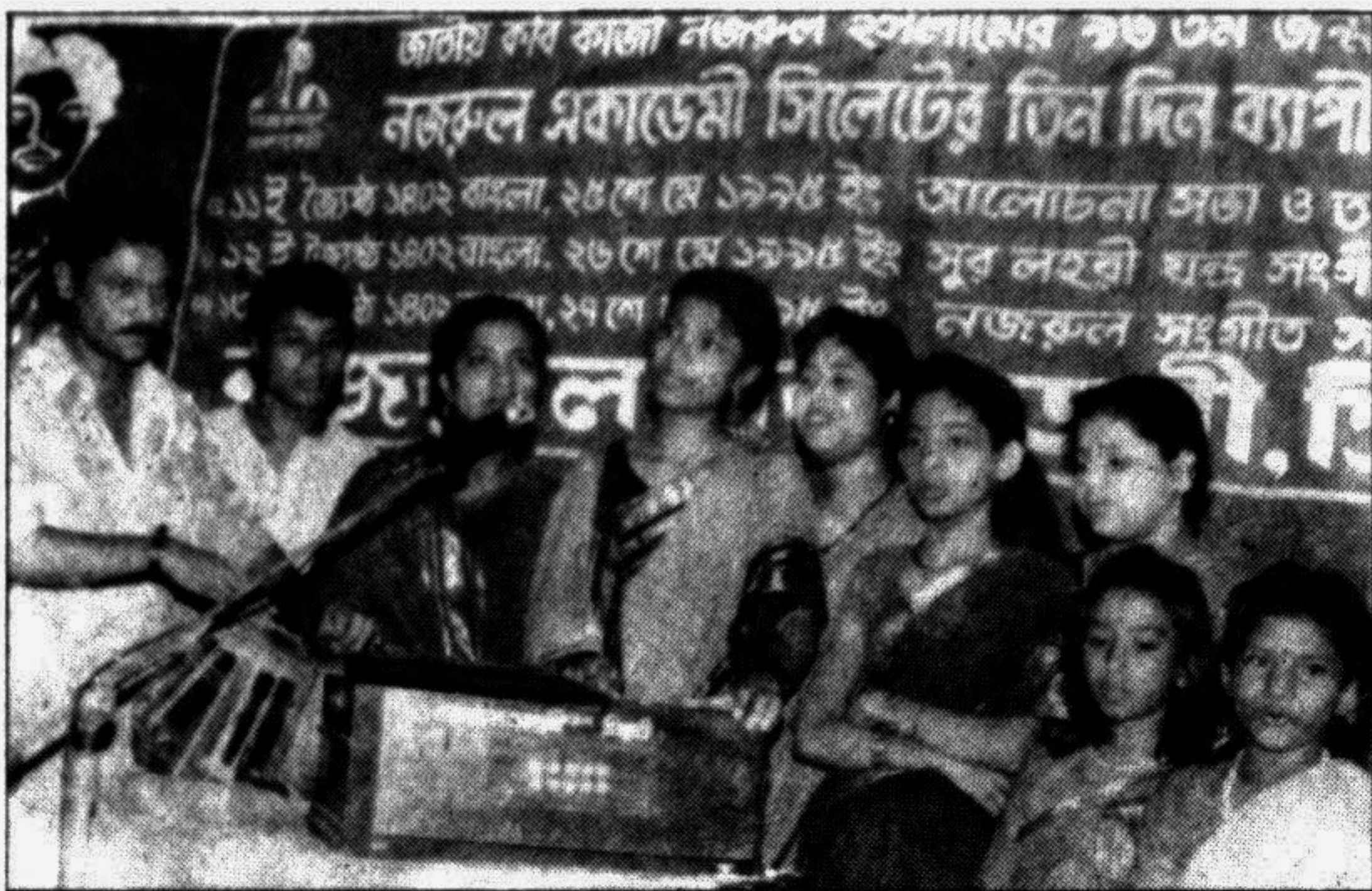
SYLHET: Artists rendering songs at a cultural function organised by the Nazrul Academy, Sylhet, to mark the 96th birth anniversary of the national poet Kazi Nazrul Islam.