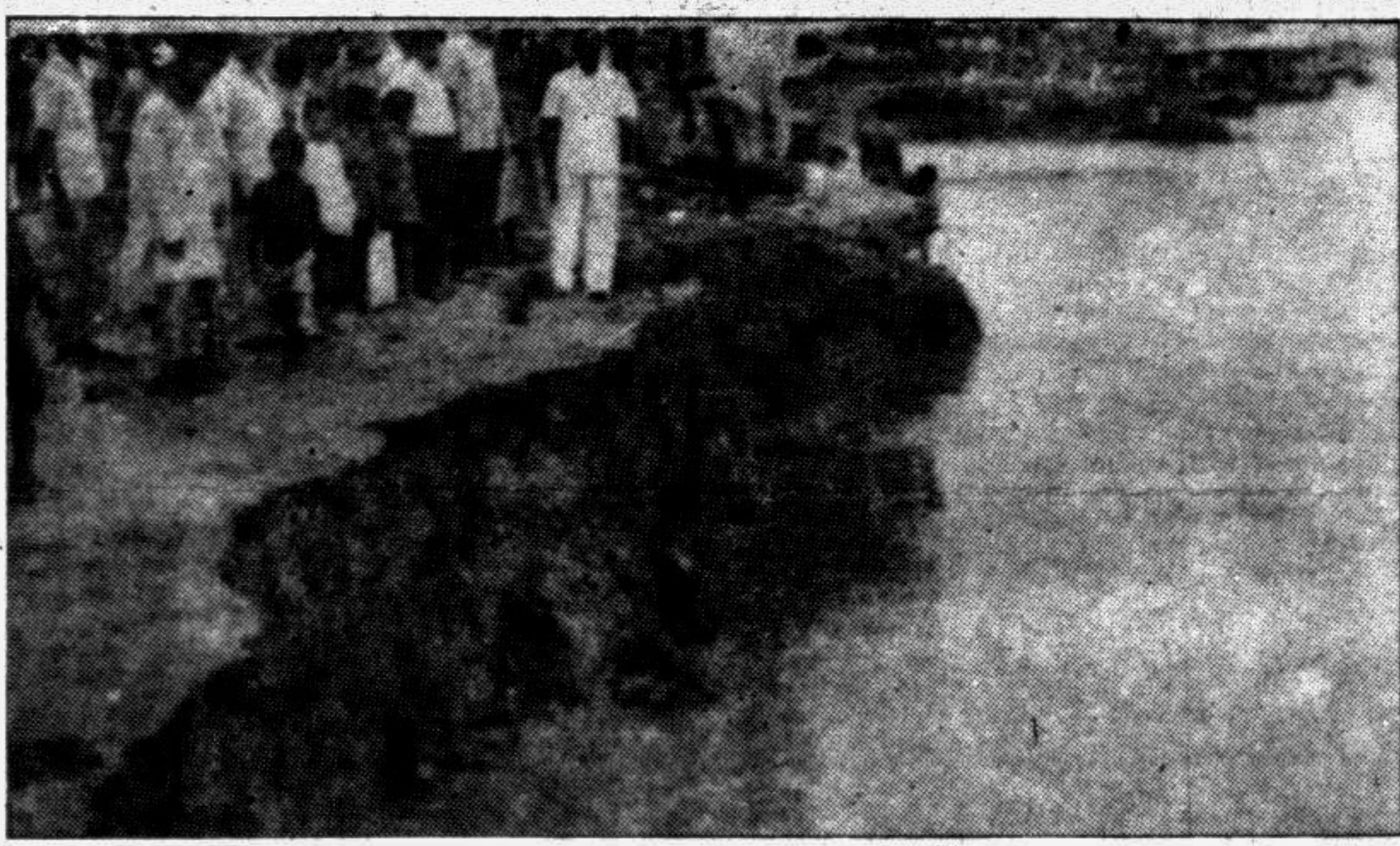
GAIBANDHA: Erosion by the river Teesta has devoured huge tracts of cultivable land and dwelling houses in village Ujanbochagari under Sadar thana recently.

From Our Correspondent MEHERPUR, June 2: The number of drug addicts is growing alarmingly in the Meherpur town. Even youths in the rural areas have started taking different types of like opium, morphin, sedative tablets, Marita Sanjibani and other types of liquids containing alcohol. According to an official survey, Meherpur town and its suburbs have turned into open markets of drugs. All kinds of drugs and alcohol are available at drug stores, grocery stores and other shops. Cigarettes containing ganja are also available in certain places. The survey reveals that addicted teenagers at present constitute about 10 per cent but the number is growing fast. It is alleged that a well-organised gang has been smuggling in these drugs from across the border. It is also alleged that these drug addicted youths are involved in the various crimes. Residents complain that most youths buy the rectified spirit from homeopathic doctors and take it as alcohol mixing it with water. It is alleged that some people are illegally selling the spirit to the addicts at exorbitant prices. School and college students make up the largest segment of addicts, it is learnt.