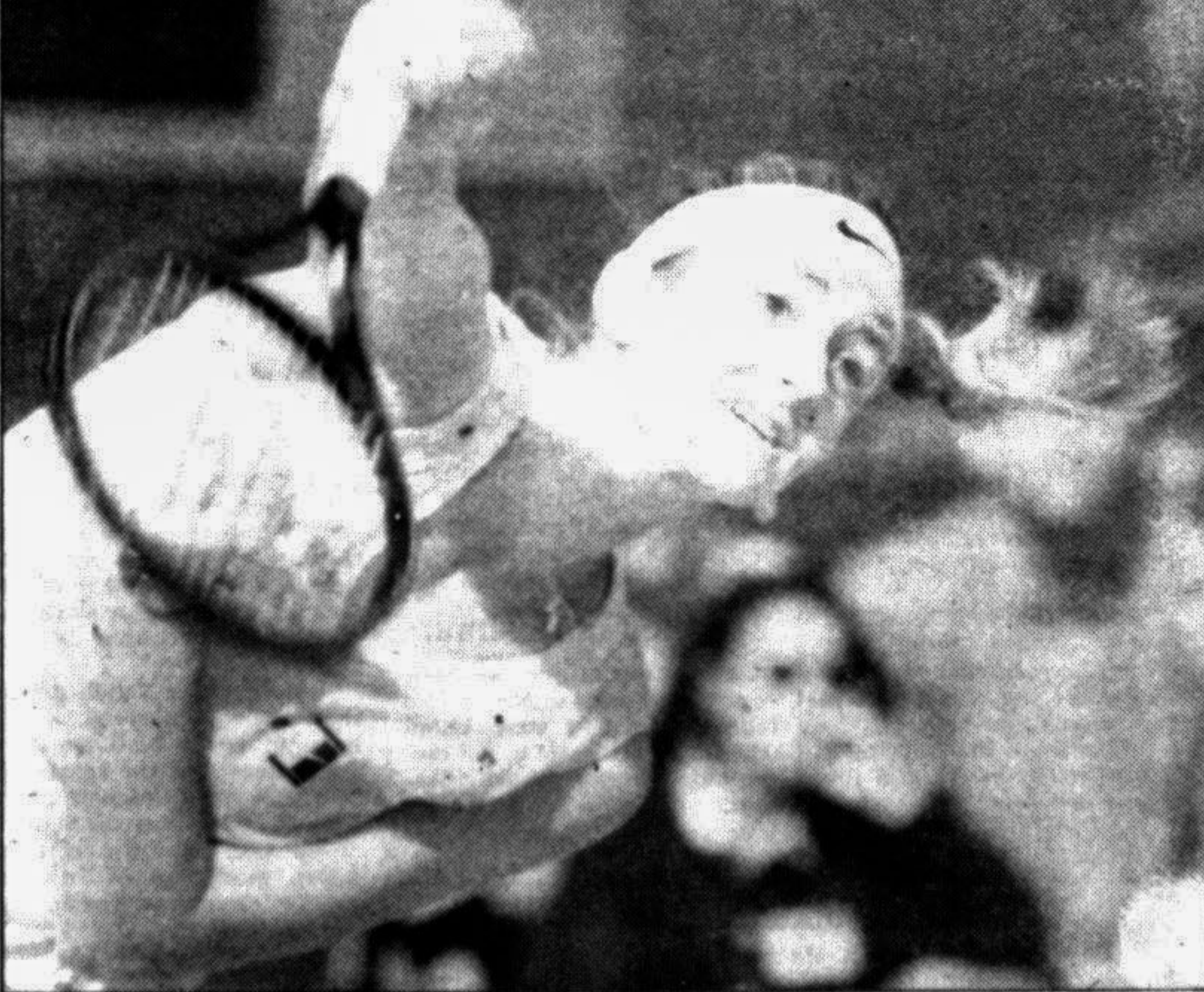
Third-seeded French woman Mary Pierce blasts her fearsome serve against Australian Nicali Bradtke during their first round match of the French Open Championships on the Centre-Court at Roland Garros on May 30. Pierce won 6-1, 6-3.