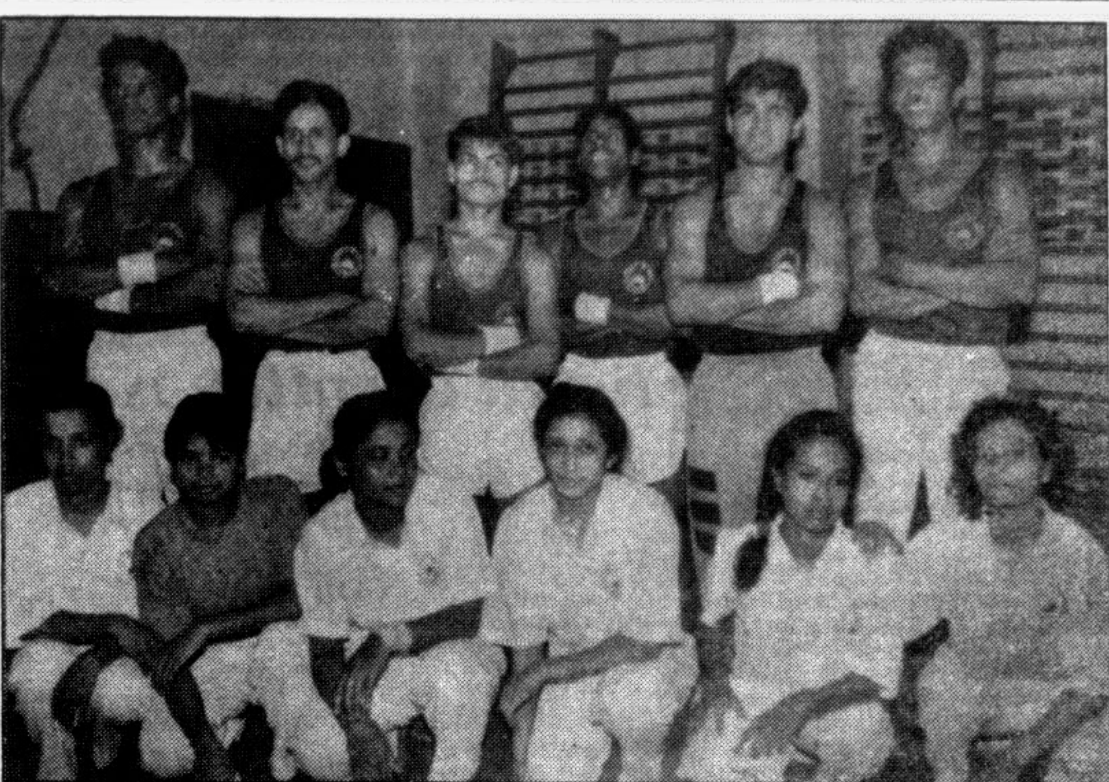
The Bangladesh Ansars' gymnasts who clinched the top slot in the Afsar Group 21st national gymnast championships at NSC gymnasium yesterday.

LAUSANNE, Switzerland, May 31: International Olympic Committee (IOC) president Juan Antonio Samaranch confirmed his "total support" for Sydney to host the 2000 Games here on Tuesday, despite concerns over finances, reports AP. John Coates, president of the Australian Olympic Committee, was quoted in newspaper reports on Sunday saying a row over finances had led many international officials to question whether Sydney wanted to host the Games. But he appeared to step back from those warnings later Sunday, telling a radio station the IOC had not previously removed a city's right to host the Games. The Sun Herald newspaper had reported that Samaranch was concerned the New South Wales state government was not fully behind the hosting of the Olympics. The recently-elected labour state government's Olympics Minister Michael Knight had earlier warned taxpayers might have to pay an extra 600 million Australian dollars (440 million US dollars) due to a shortfall in private funding. But Samaranch said here on Tuesday the Sydney Organising Committee (SOCOG) had his total support. The IOC said it had received firm assurances that the Australian Federal Government and the state government of New South Wales were behind the SOCOG. "The IOC had asked the SOCOG to present a report on the situation in Australia and its repercussions for the next executive committee meeting of the IOC in Budapest from June 12," said an IOC statement.