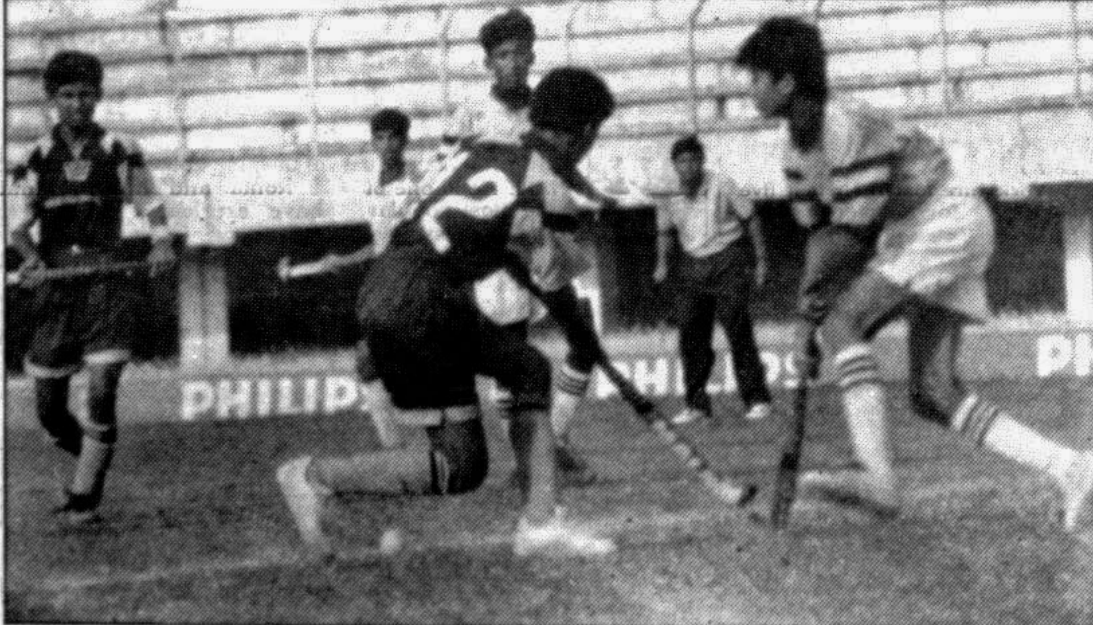
Mid-pitch action from yesterday's Transcom national championship match between Mojuddin High School and Narayanganj High School at the Hockey Stadium yesterday. The match ended goalless.