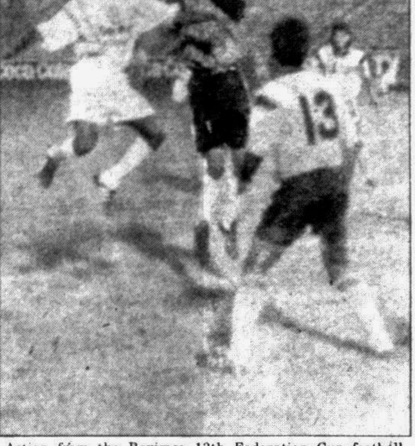
Action from the Beximco 13th Federation Cup football tournament match between Bangladesh Boys and Arambagh Krira Chakra at the Dhaka Stadium yesterday. Boys beat Arambagh 1-0.

I think the football over there would suit me better," said the 27-year-old, who shone in the 1994 World Cup in which Sweden finished third.