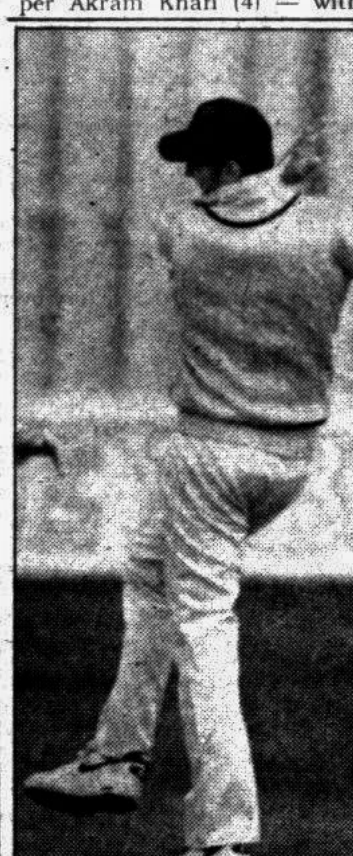
Leicester's Darren Maddy celebrates capturing the prized wicket of West Indian opener Carl Hooper (29) during the opening day's play of the three day match in Leicester on Tuesday.

In front of a big crowd on a hot summer noon, the ever energetic middle-order batsman overshadowed yet another brilliant performance of former national captain Minhazul Abedin Nannu, who scored a sparkling 91 off 97 balls in Acme's commanding but not a safe total of 228 for five in the stipulated 45 overs.