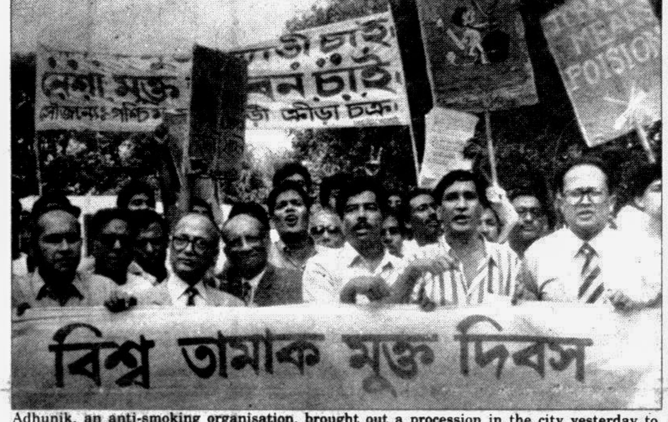
Adhunik, an anti-smoking organisation, brought out a procession in the city yesterday to mark the World No-Tobacco Day.