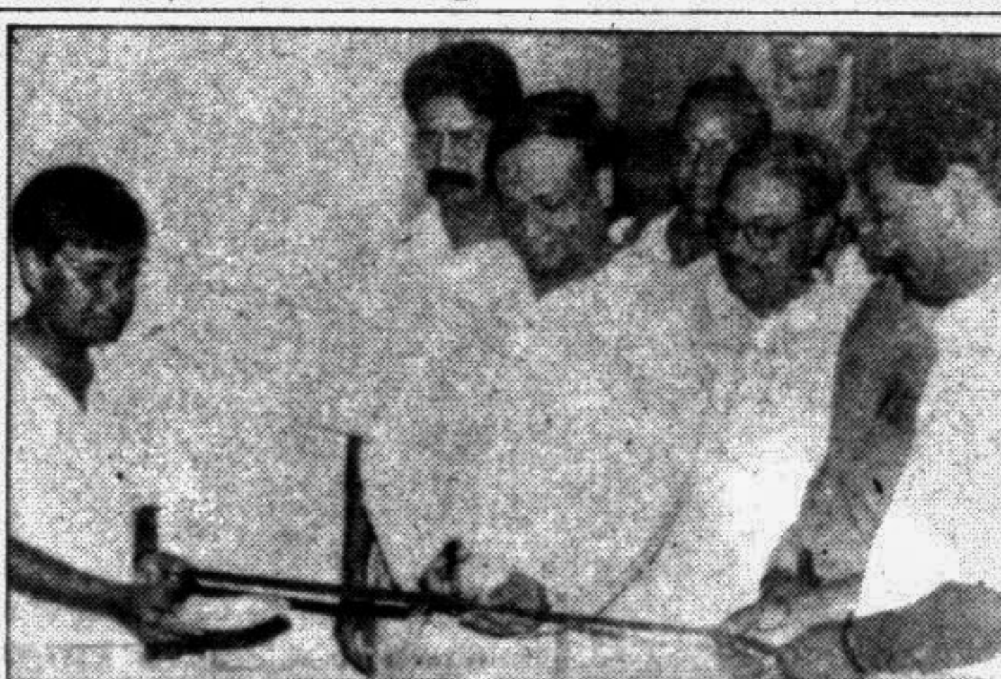
Works Minister Rafiqul Islam formally opening the new building of the Bangladesh Photojournalists' Association in the city yesterday.

The political parties should educate the electorates for having a democratic culture in the country, he said and also called for a consensus among the political parties to ensure free and fair polls.