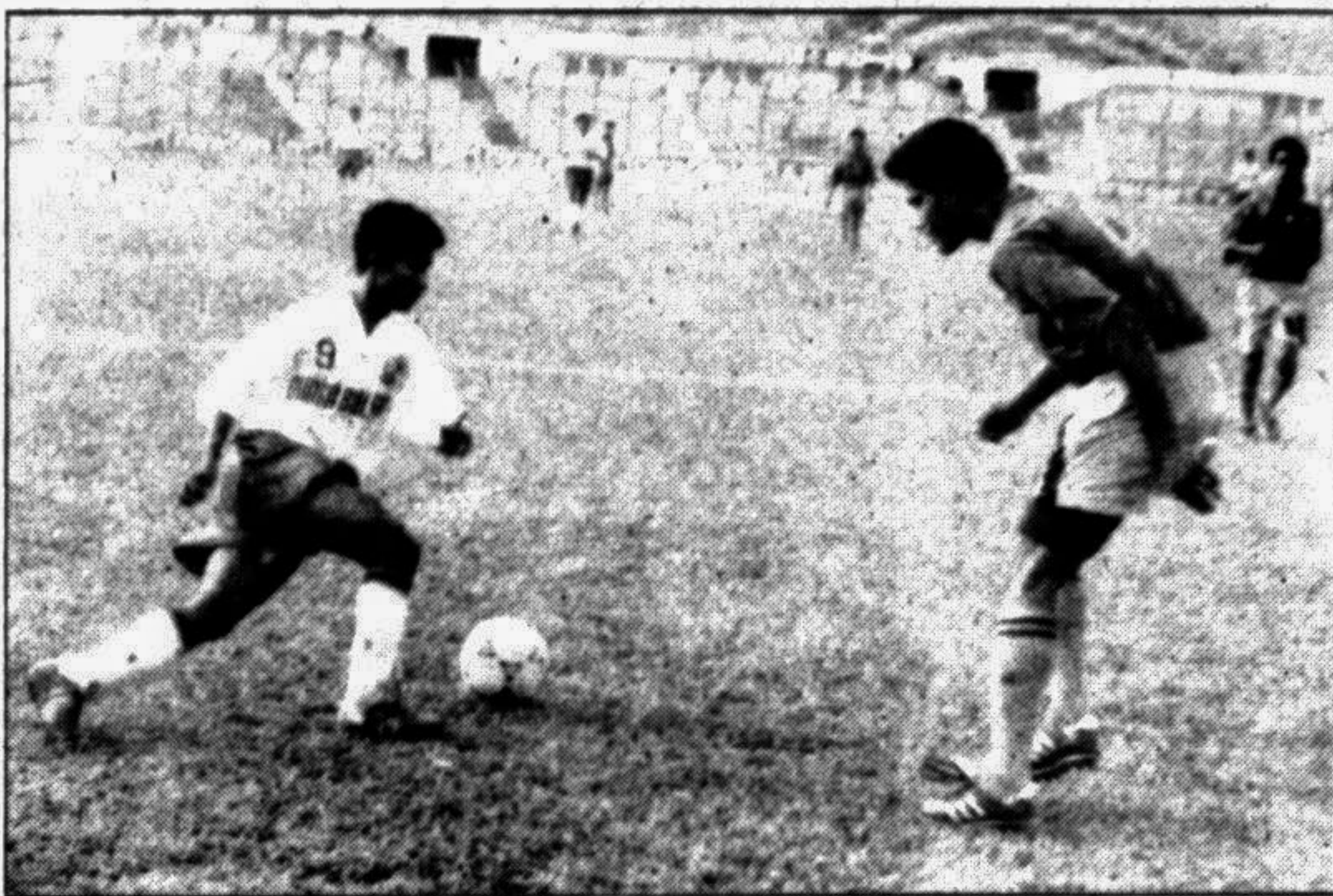
Action from yesterday's Beximco 13th Federation Cup football tournament match between Eskaton SS and Udayan KC at the Dhaka Stadium. Eskaton won 5-3.