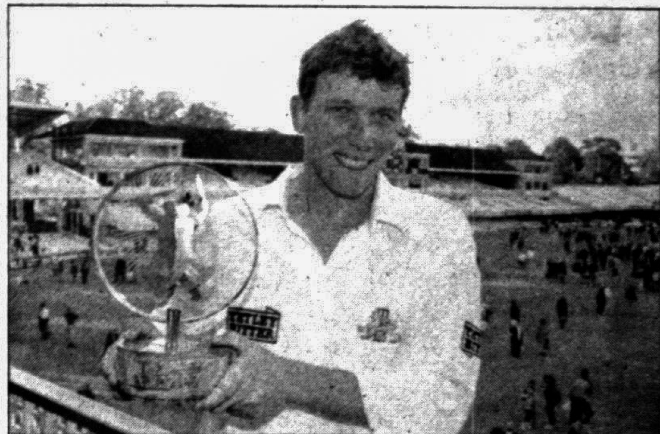
England skipper Mike Atherton holds the Texaco Trophy after winning the third and final one-day international against West Indies at Lord's on May 28. England won by 73 runs to clinch the series 2-1.

Farashganj SC vs Police AC (4 pm) Rahmatganj MFS vs Diganta Proshari of Rajshahi (6 pm)