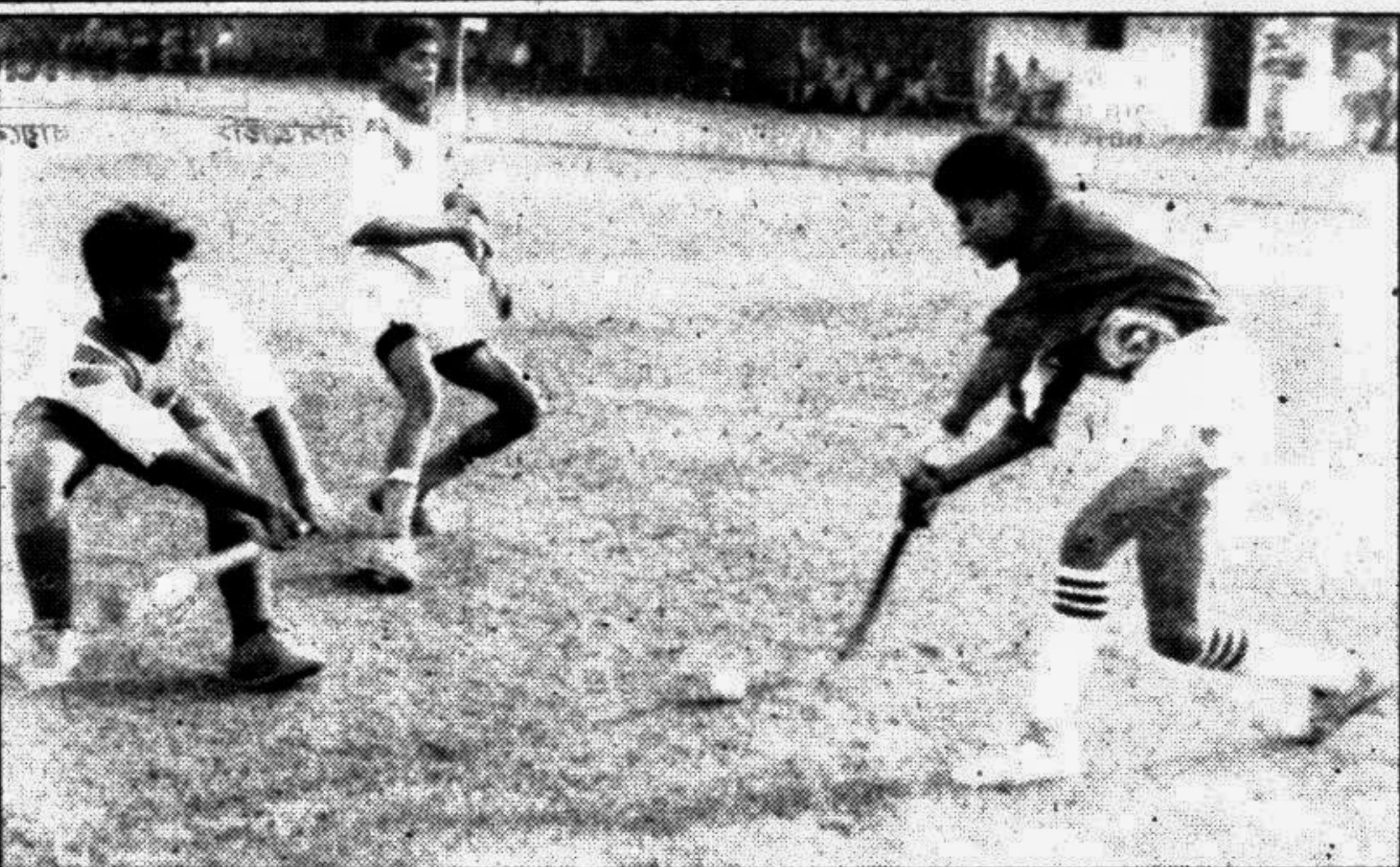
Mid-pitch action from the Transcom national school hockey championship match between Muslim Govt High School and Mymensingh Zilla School at Hockey Stadium yesterday. Muslim Govt won 3-1.