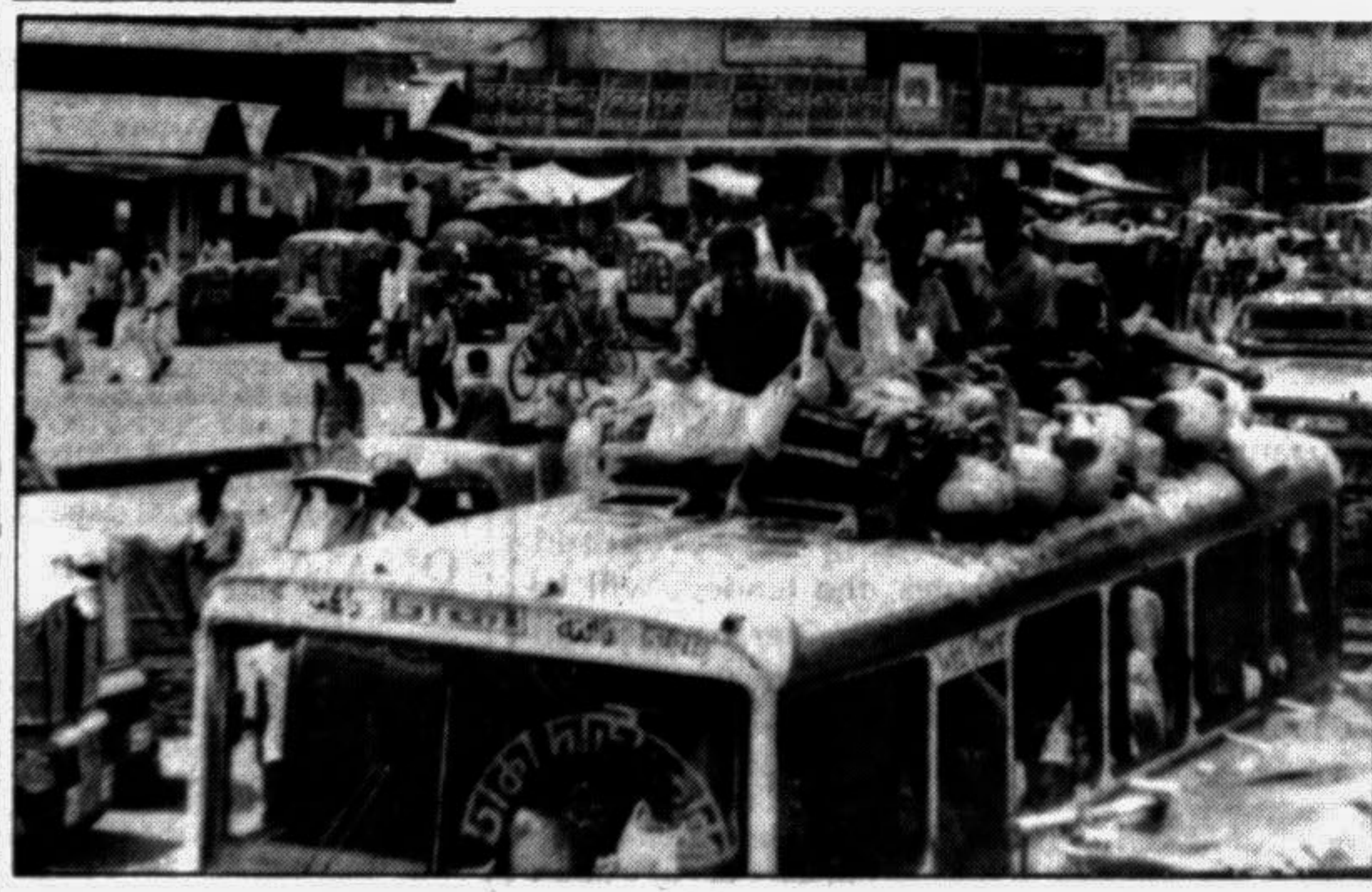
The city's Gulistan area on the second day of the transport strike yesterday.