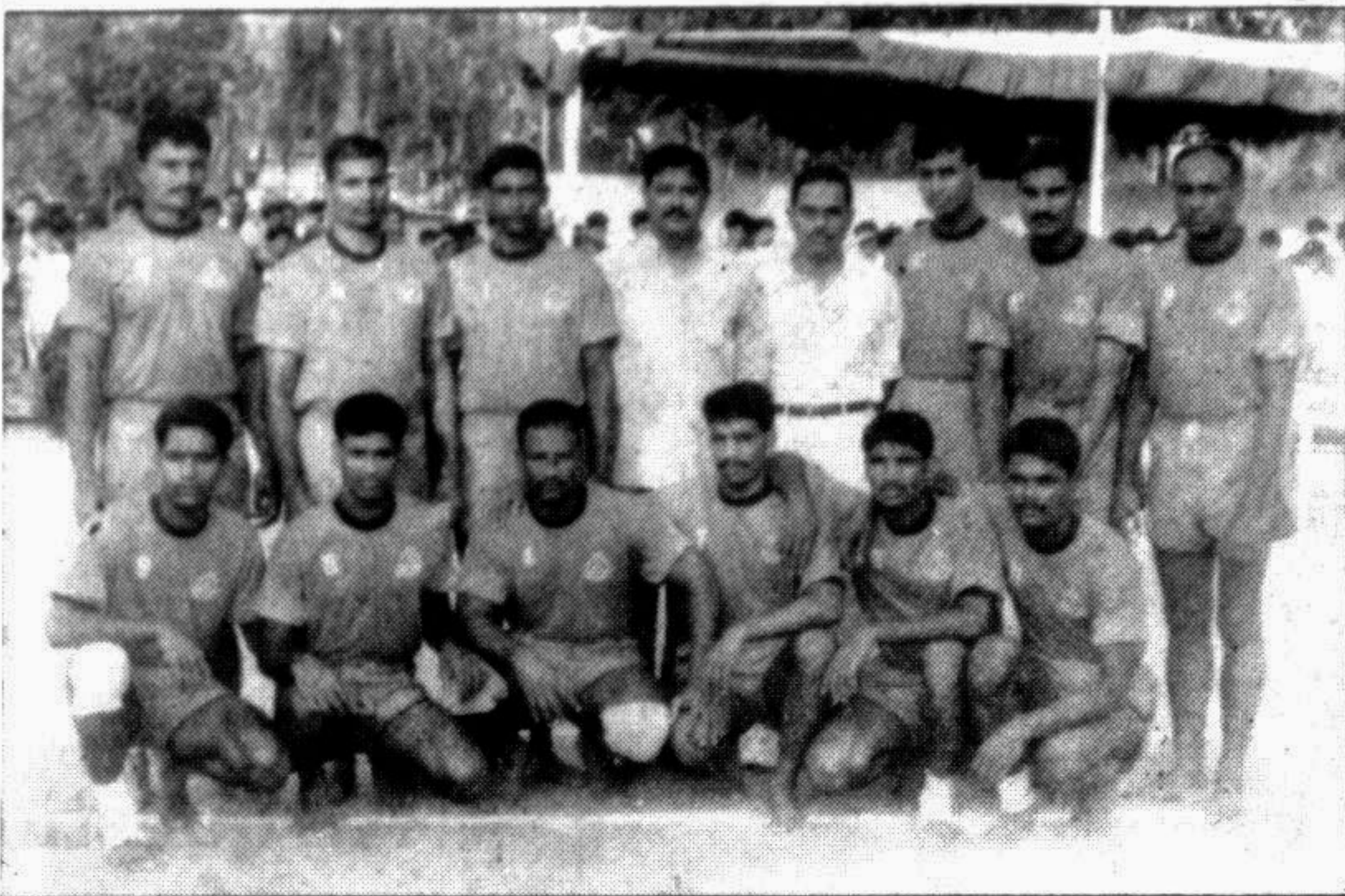
Players and officials of Bangladesh Rifles who clinched the 21st national kabaddi title beating Bangladesh Ansars by 11-6 points, in the final at the court of the Outer Stadium yesterday.