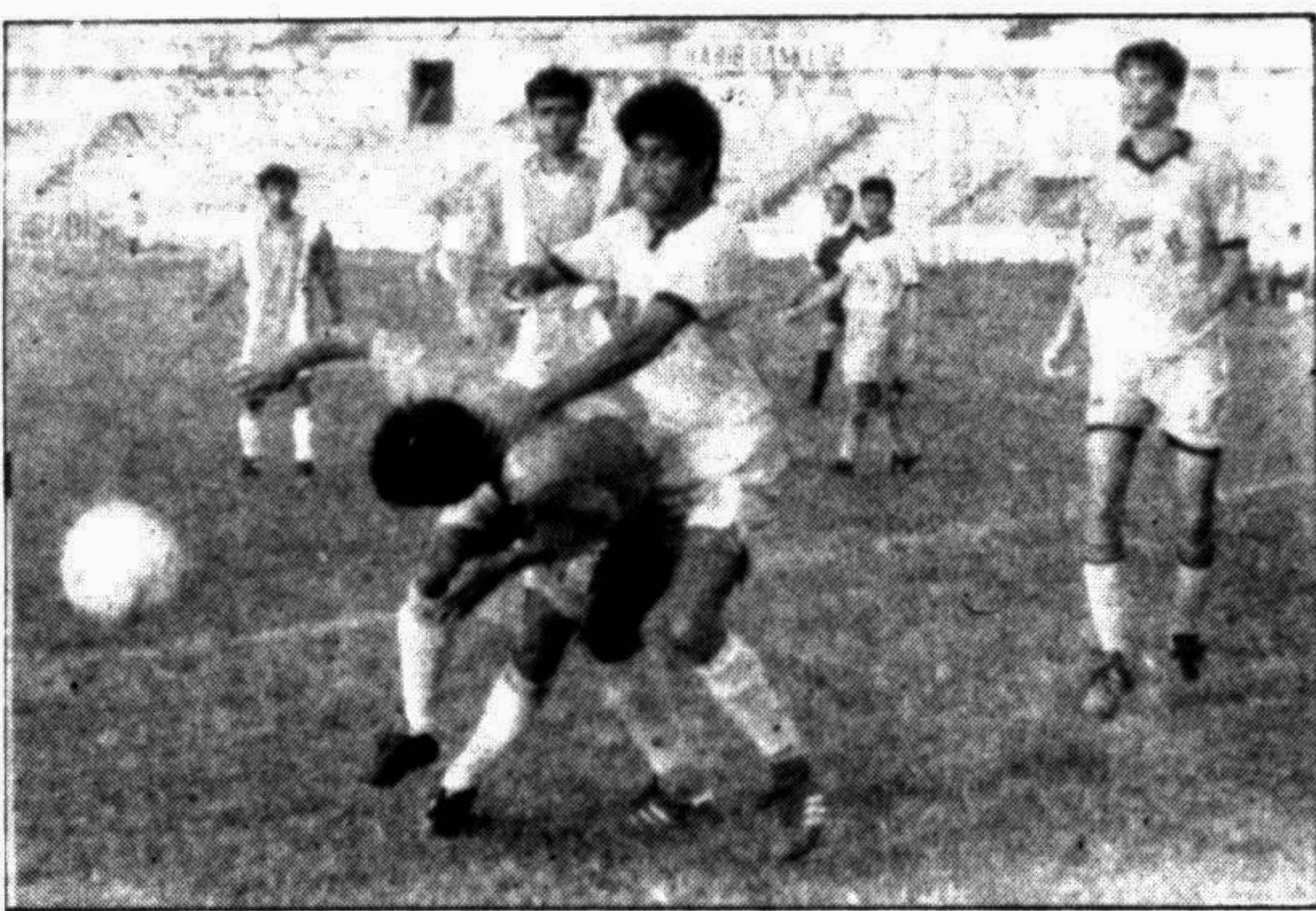
SOC'ER OR SOMETHING: Players engage in an on-field-tussle to take control over the ball during yesterday's Beximco 13th Federation Cup match between Dhanmondi Club and Diganta Prashari of Rajshahi at the Dhaka Stadium. Diganta won by 2-0.

He is theoretically barred from taking part in the Rio de Janeiro Championship, which is reaching its climax with five rounds of matches in the eight-team final stage left. Flamengo are level on points with Fluminense and Botafogo at the top.