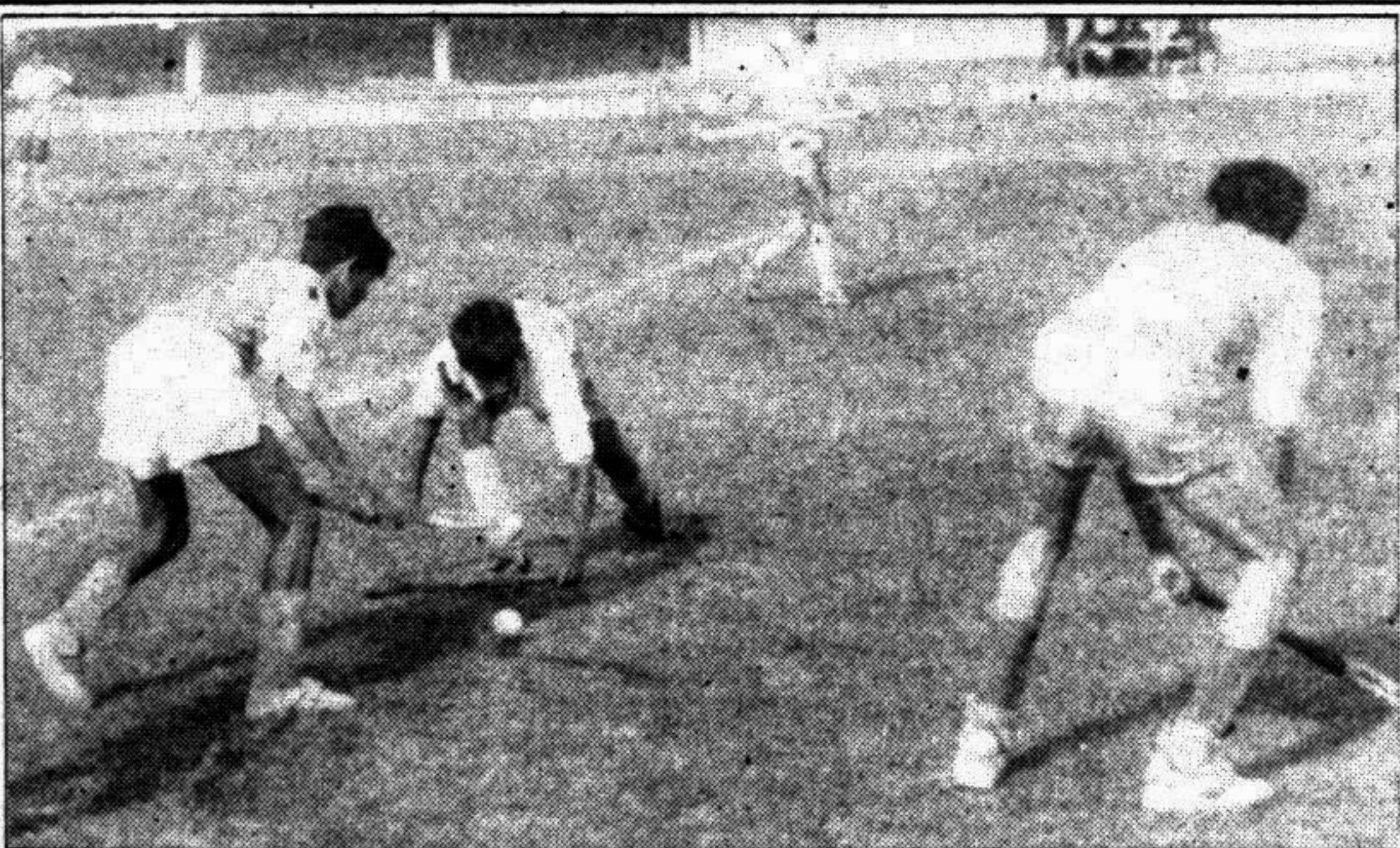
Action from yesterday's Transcom national schools championship match between Ahmed Bawani Academy and Harinal High School at the Hockey Stadium. Ahmed Bawani won the match by a solitary goal.