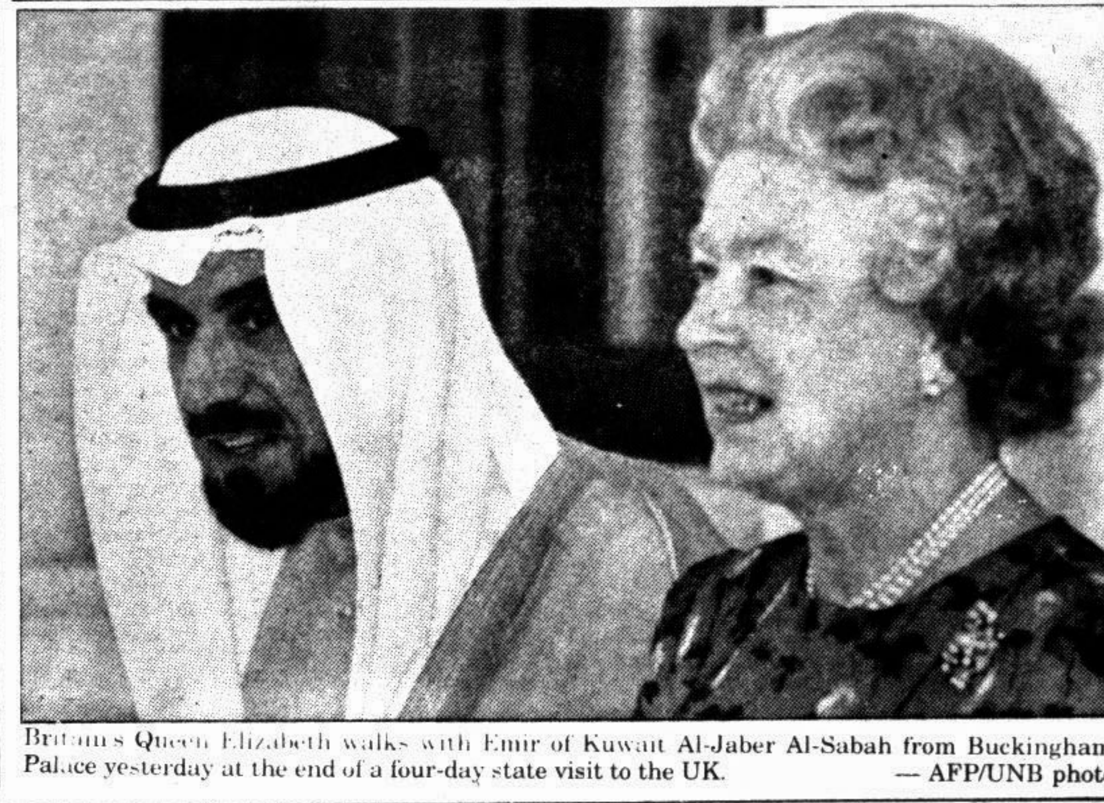
British Queen Elizabeth walks with Emir of Kuwait Al-Jaber Al-Sabah from Buckingham Palace yesterday at the end of a four-day state visit to the UK.

During the summit and official talks Prime Minister Begum Zia was assisted by For-