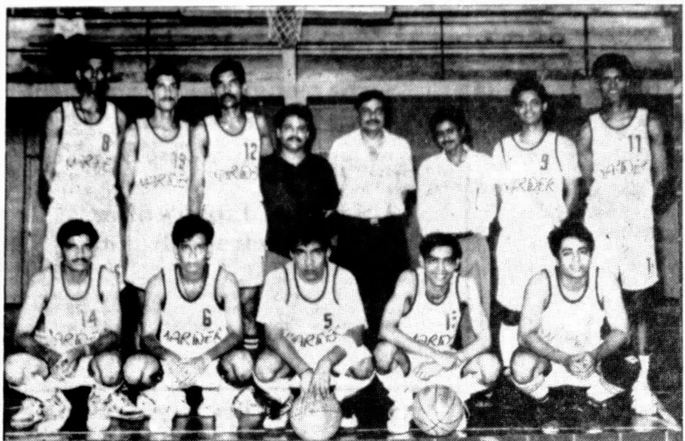
Players and officials of the Mariner Youngs Club who were declared unbeaten Partex First Division basketball champions with a match to spare on Thursday.