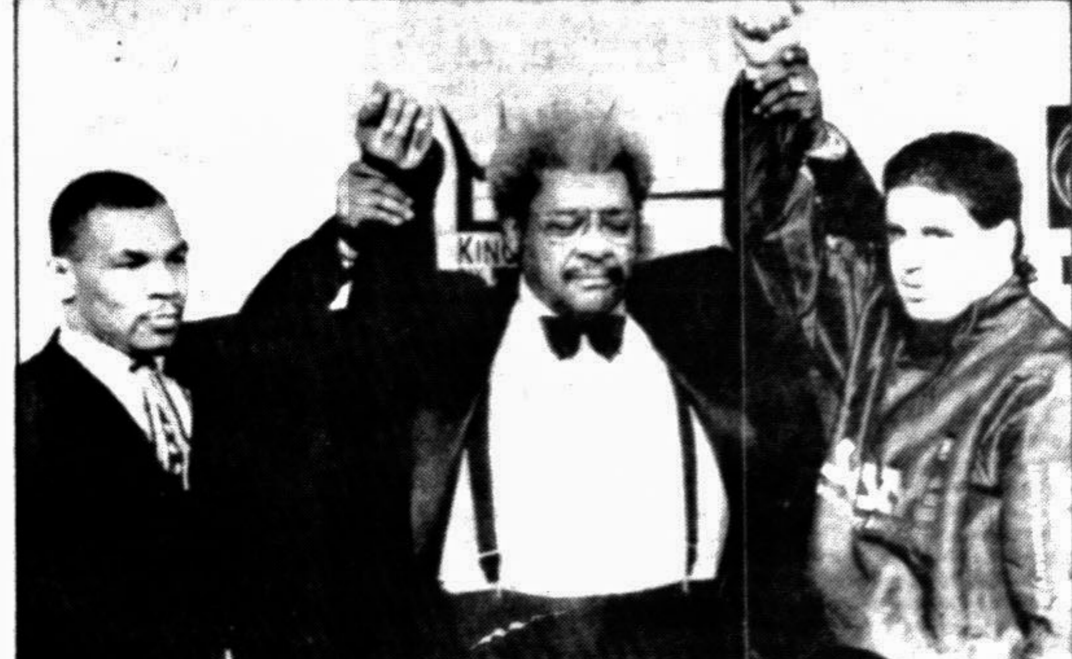
Promoter Don King (C) holds up the arms of former heavyweight champion Mike Tyson (L) and Peter McNeeley following a press conference at the MGM Grand Hotel in Las Vegas on May 24.

BOLOGNA, Italy, May 26: Top-seeded Gilbert Schaller eliminated Mats Wilander to earn a quarterfinal berth in the Bologna ATP action. Two unseeded players, Marcelo Rios of Chile and Karim Alami of Morocco, also advanced in second-round play Thursday, reports AP.