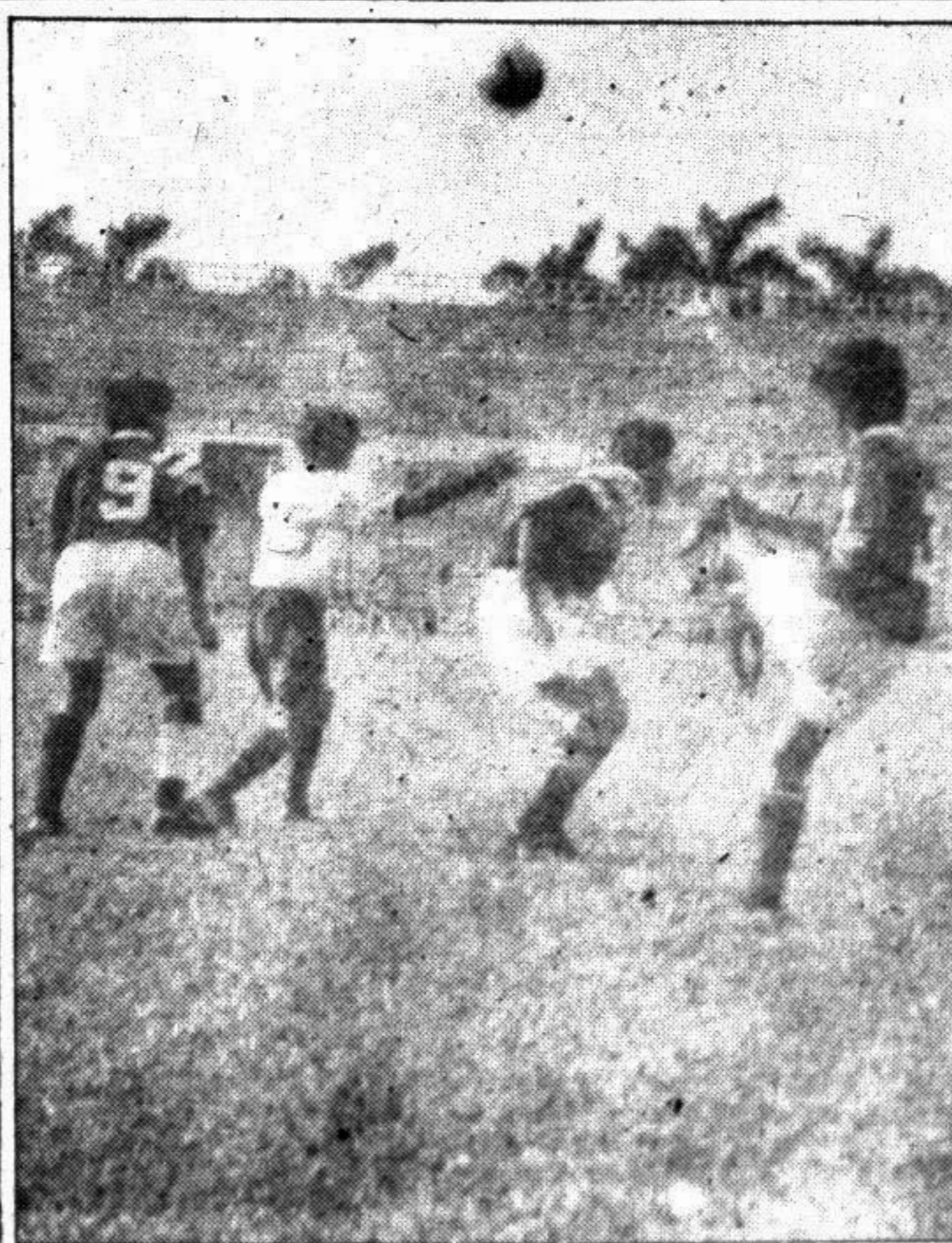
Action from the Beximco 13th Federation Cup football tournament match between Police AC and PWD at the Dhaka Stadium yesterday. Police won 3-0.