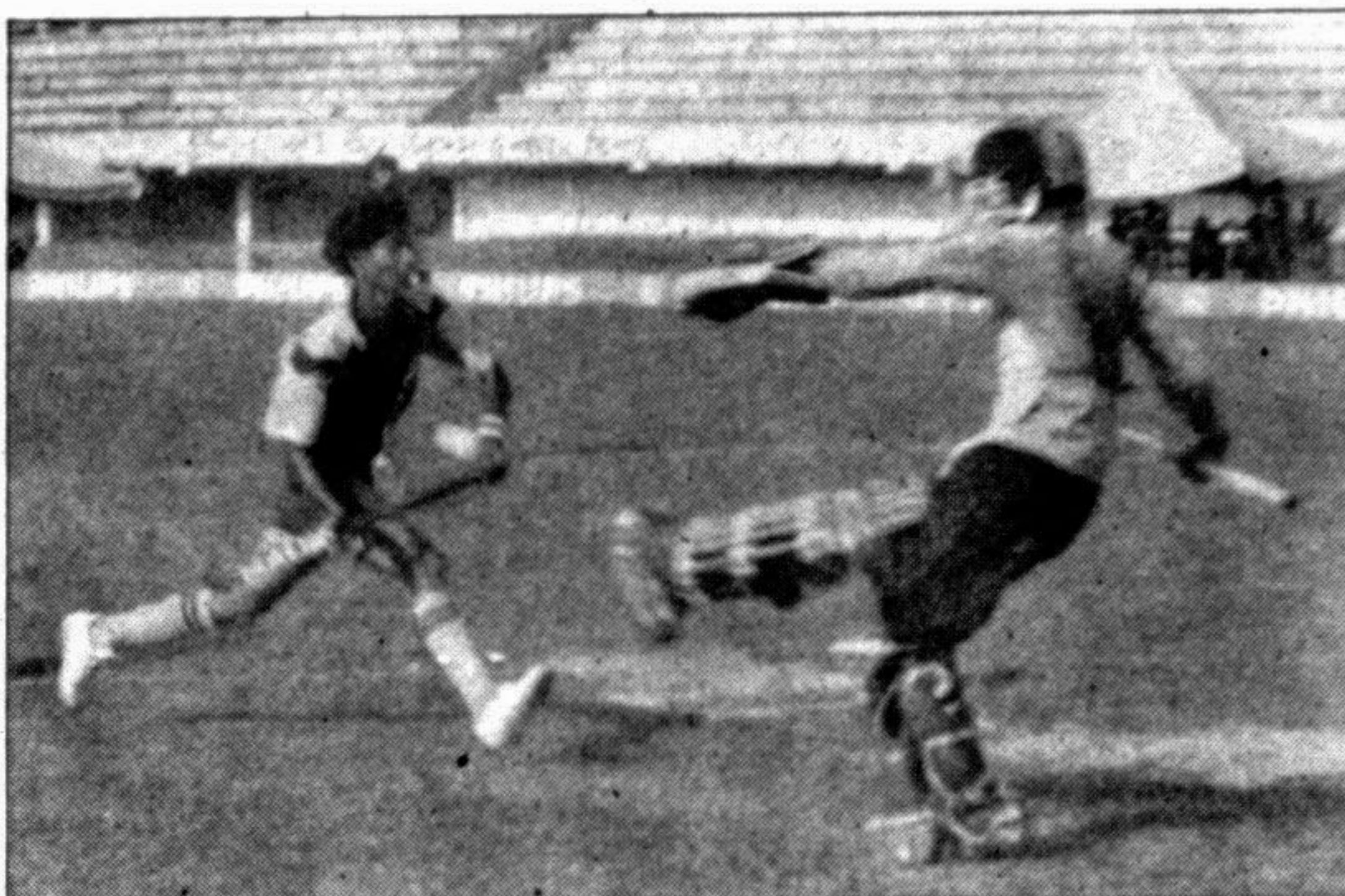
A goal mouth incident from yesterday's Transcom national schools tournament between Narayanganj High School and Munshiganj High School at the Hockey Stadium. Narayanganj trounced Munshiganj 3-0.

Northern Ireland got on the board in the seventh minute with what turned out to be their lone goal of the night.