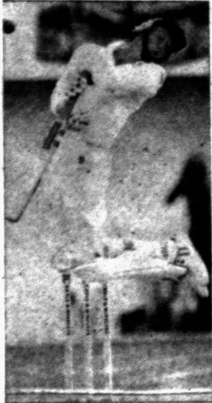
ATHERTON ... 92 brilliant one-handed catch leaping to his right.

IC pitched outside off stump, Stewart got an edge as he aimed to cut and wicket-keeper Junior Murray held a