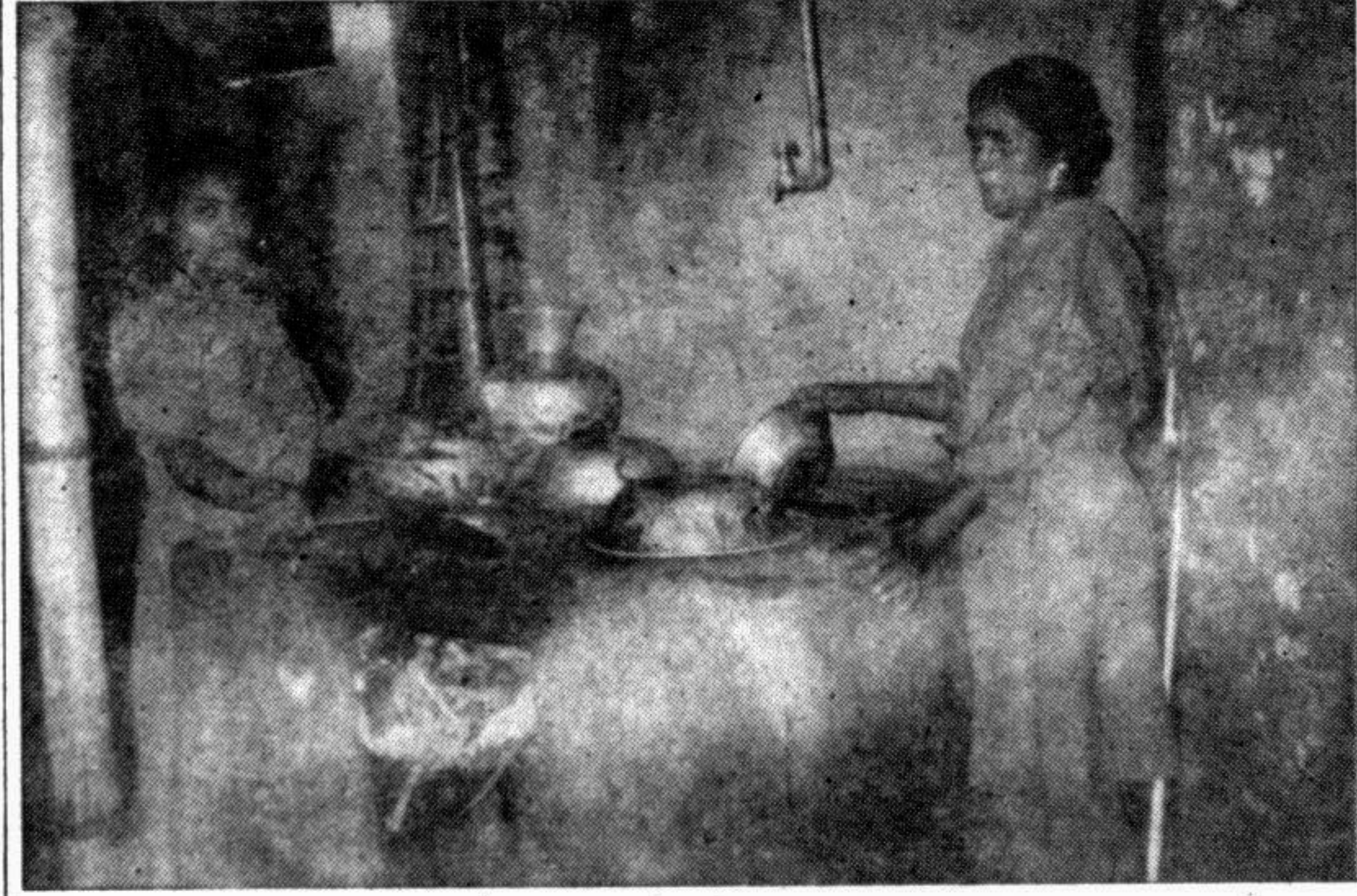
Women at work at a factory in Kushtia

Meantime, the death of the animals has caused panic among the farmers.