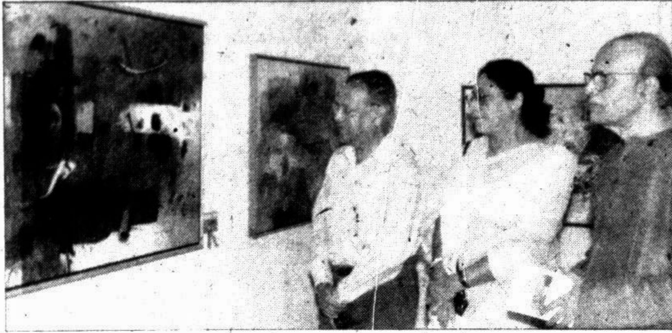
Visitors at the fourth anniversary exhibition of the Shilpagon Art Gallery which began in the city yesterday.

But the sun is back already, in all its old splendence. "Do not go out between 11 am and 3 pm", Indian magazines advise by way of skin care. White is back in fashion, and Fair and Lovely tubes are squirting all over the place. But oh, for the rain that dances on the streets. The smell of the earth (so fresh, so clean, so real), and wet leaves. The sound of rain water draining from the pipes. The touch of wet, wet grass. When will it rain again?