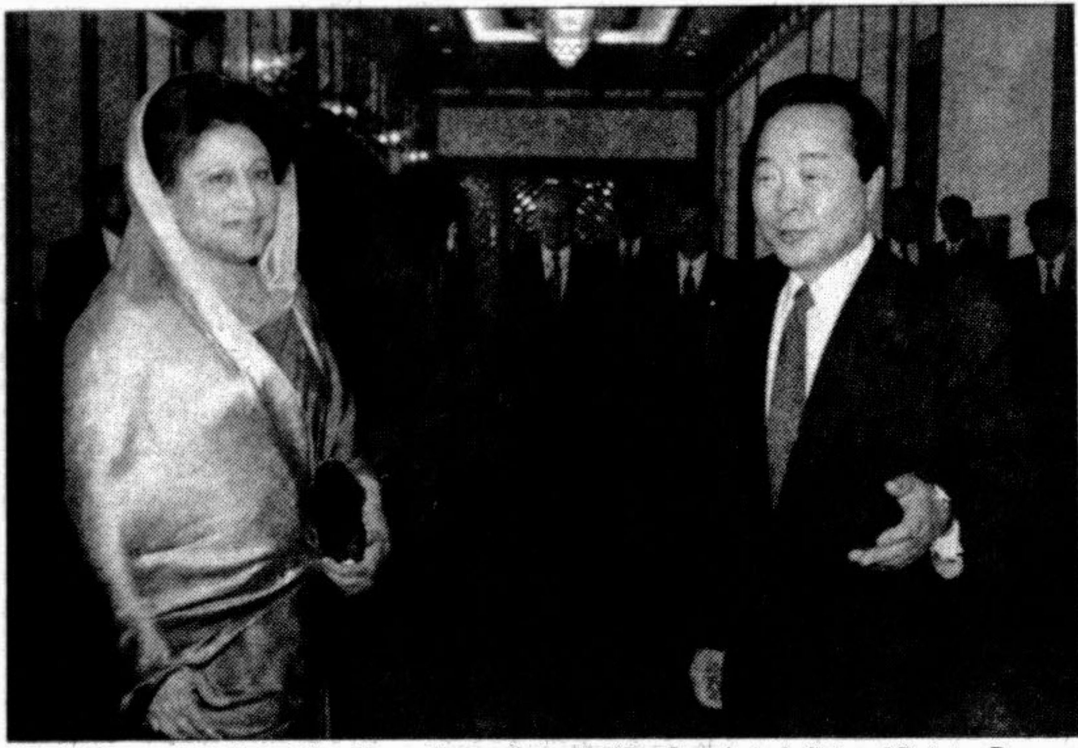
South Korean President Kim Young-Sam ushers visiting Bangladesh Prime Minister Begum Khaleda Zia in the reception room of the Presidential Blue House in Seoul, South Korea yesterday.