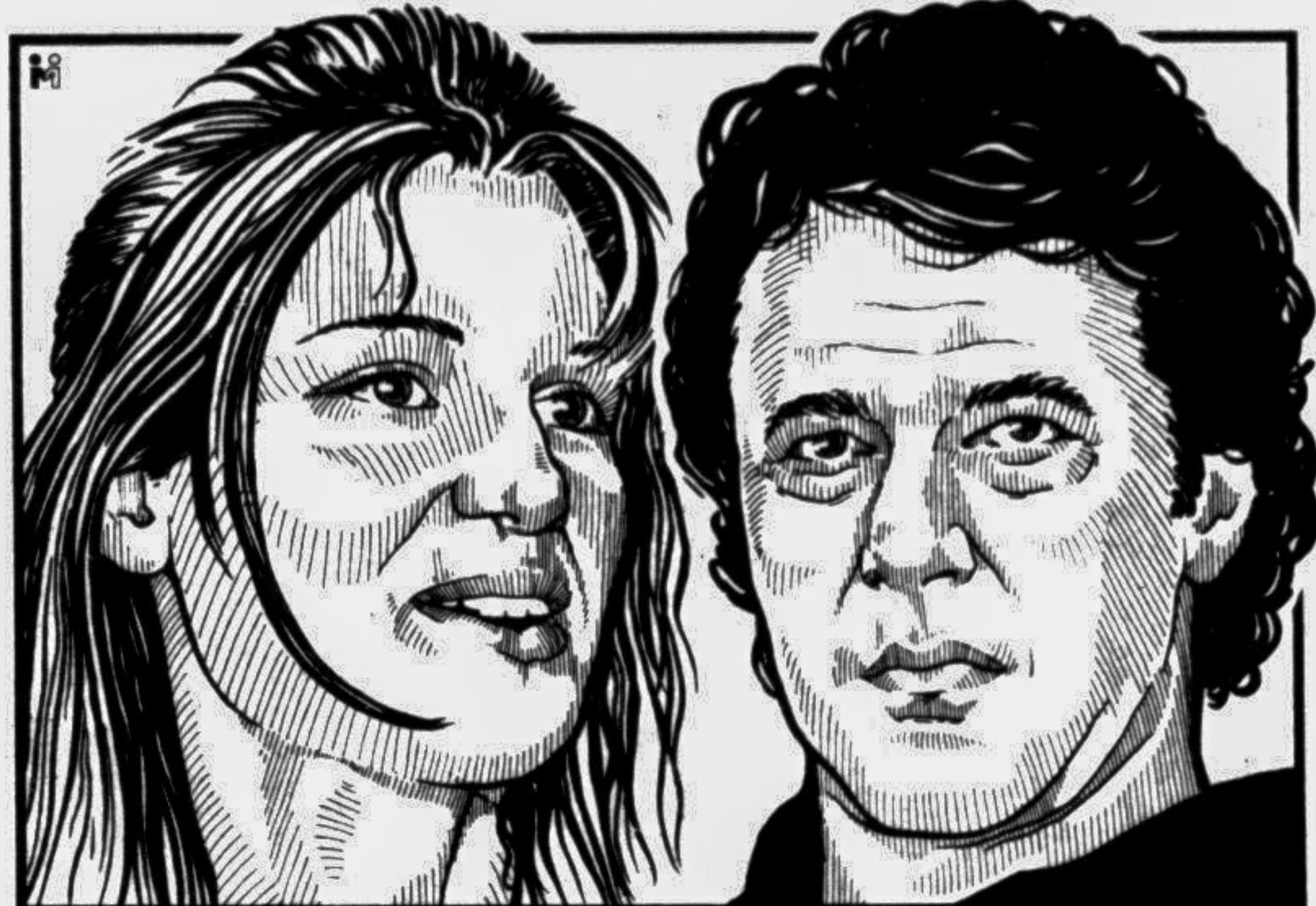
Jemima Goldsmith and Imran Khan: 'Property of the nation'

As Pakistan's most eligible bachelor, Imran Khan, left for France with his British fiancée in an attempt to find privacy — denying reports that they had already married in secret — a storm continued to rage around the cricketer's most controversial match. Gemini News Service reports on a partnership that threatens to affect a cricketing hero's political rise.