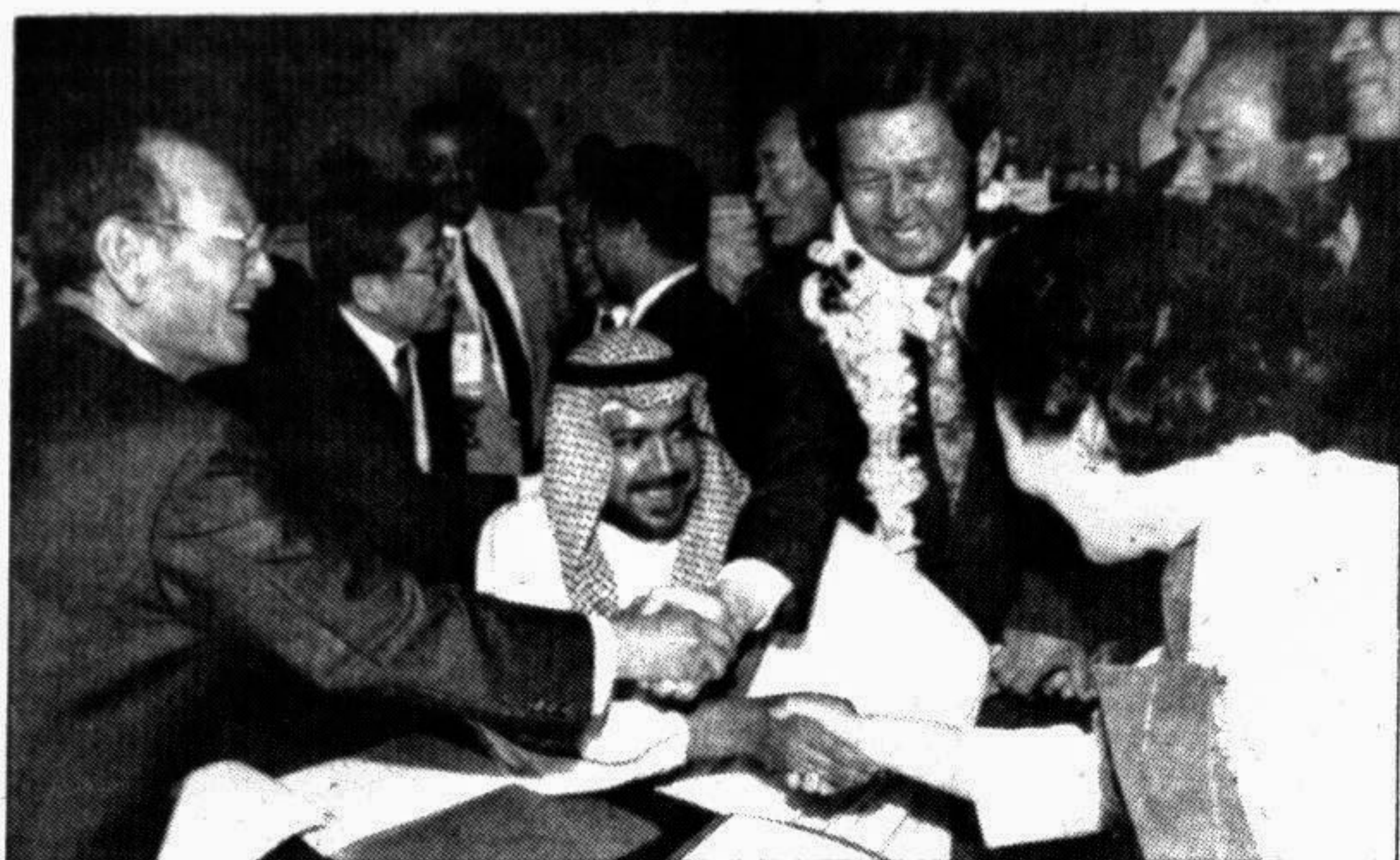
Pusan city delegates congratulate their mayor Kim Ki-Jae (garlanded) after the South Korean port city won the right to host the 2002 Asiad over Taiwan's Kaohsiung after an OCA vote in Seoul yesterday.