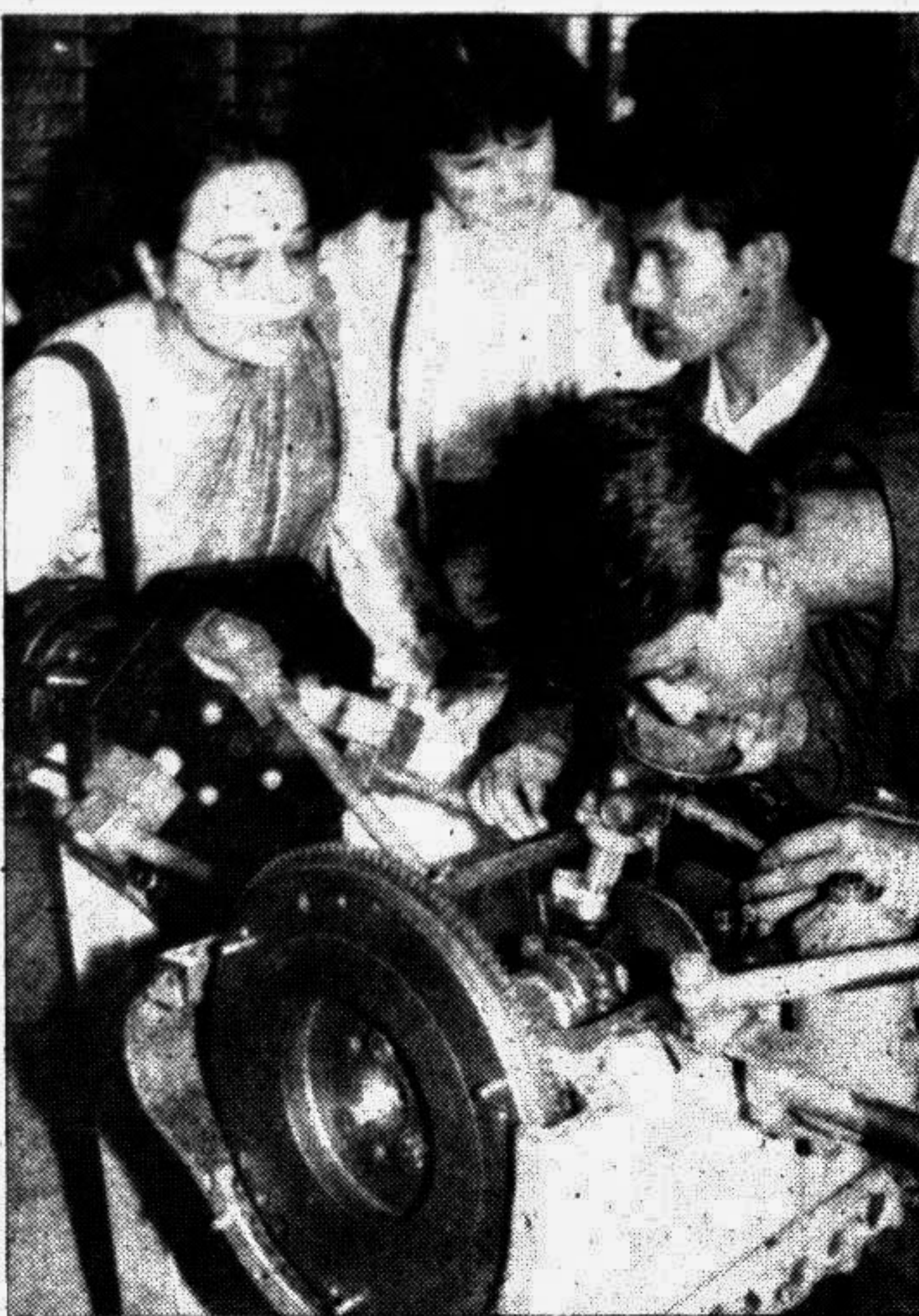
Norwegian Minister for Development Cooperation Kari Nordheim-Larsen visiting the UCEP Dhaka Technical School in the city's Mirpur area yesterday.