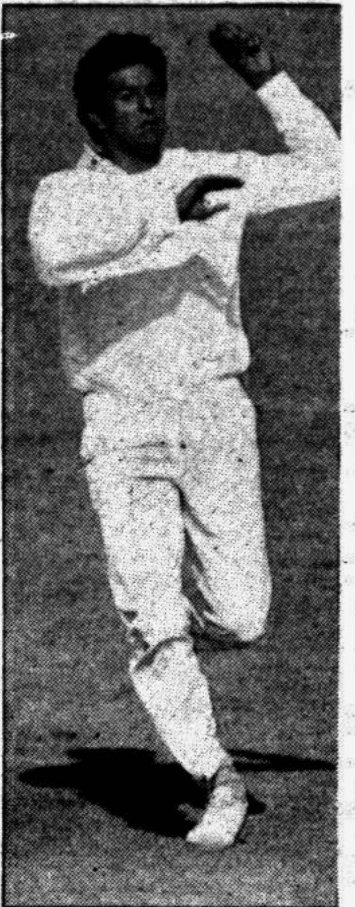
WASIM AKRAM cashire's first innings 375. They managed to add only 10 runs. Akram taking two wickets for a 6-35 driftings haul.

with Middlesex tottering at 78 for seven in reply to Lancashire.