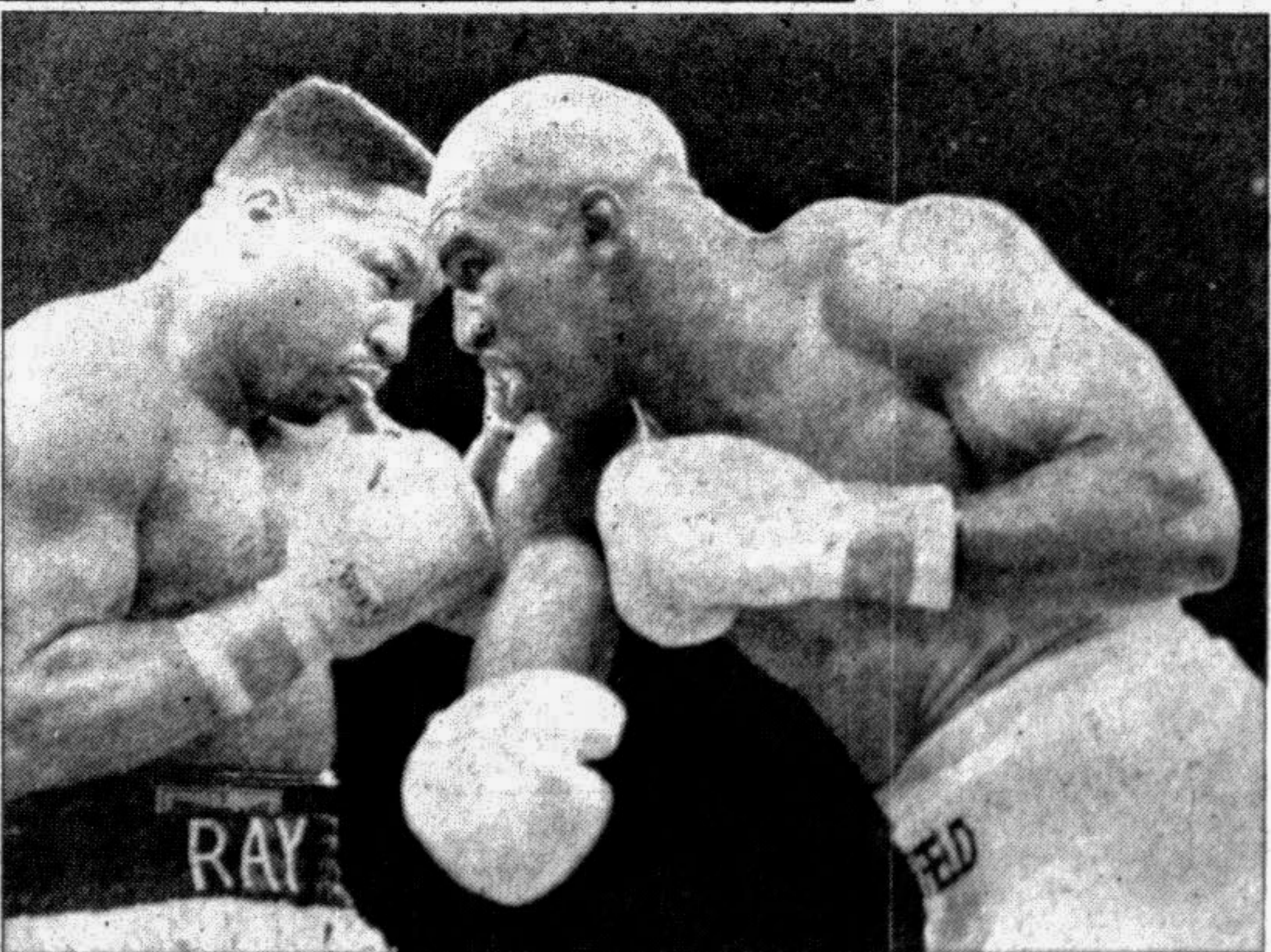
Former heavyweight champion Evander Holyfield (R) and Ray Mercer lock in a bout during their non-title fight in Atlantic City, New Jersey, on May 20. Holyfield defeated Mercer by an unanimous decision.