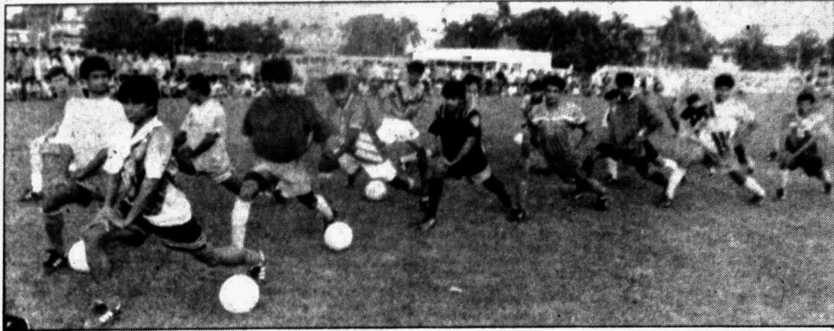
The Abahani booters are shaping themselves up during a light practice session at the Dhanmondi Cricket Stadium yesterday. The defending champions will take on Brothers Union in the first semifinal of the Nirma DMFA Cup at the Dhaka Stadium today. The match kicks-off at 5.30 pm.