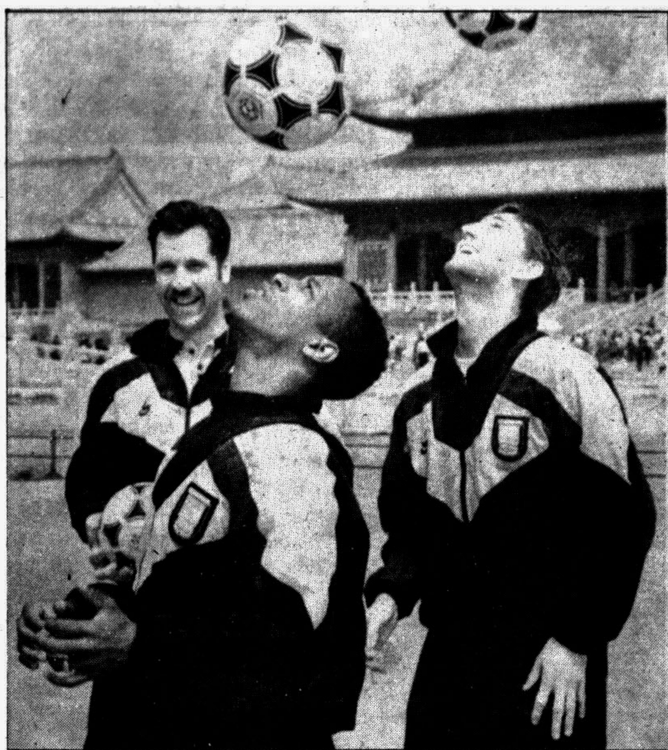
Arsenal players David Seaman (L), Ian Wright (C) and skipper Tony Adams enjoys an informal practice session at Beijing's 'Forbidden City' in the morning yesterday. The English Premier side are scheduled to take on Guoan in the evening on their first stop of a Euro-Asia Cup tour. This is the first time Arsenal is playing in Asia.

Fernandez did name his two other Brazilians — Rai and Ricardo — in the team. There has been speculation recently that either or both could be moving too. Stopper Ricardo, like Valdo, was not selected for the French Cup final.