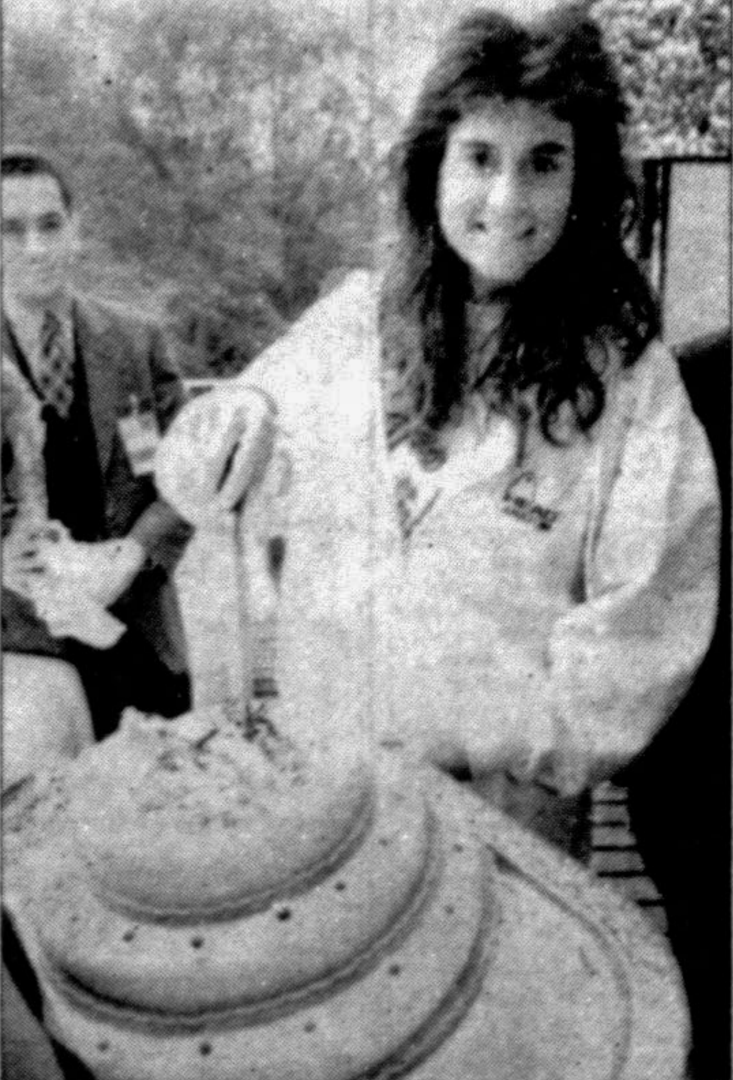
Gabriela Sabatini of Argentina celebrates her 25th birthday at the start of the Berlin international tennis tournament on May 16. She was presented a cake upon her arrival.