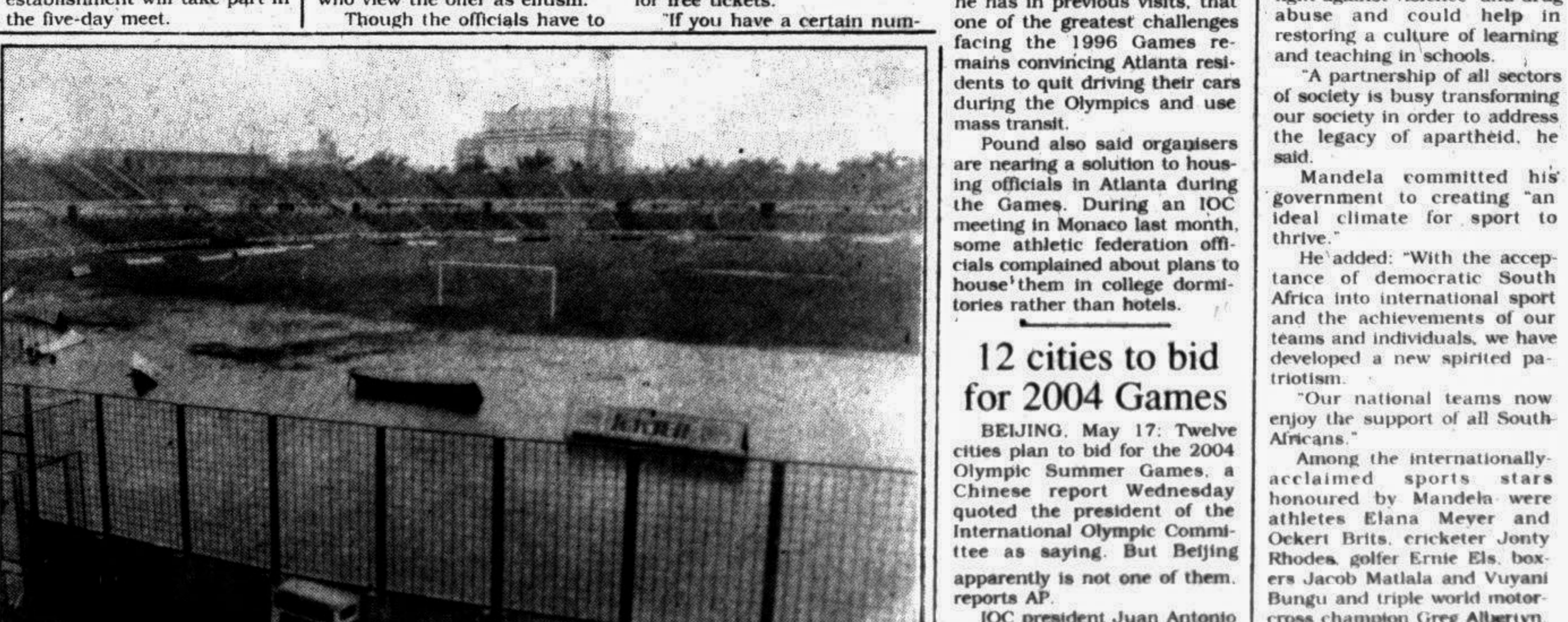
A scene of Dhaka Stadium yesterday, the country's all sport venue which went under knee-deep water following the heavy downpour that inundated the country.