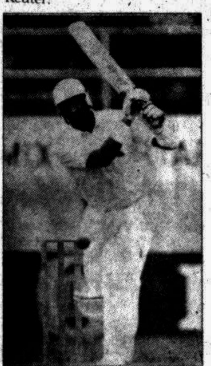
GOOCH... 117 n.o.

Bailey also sealed the man-of-the-match award with a tight spell of off-spin conceding just 21 runs in 11 overs as Scotland limped to 151 for five in reply.