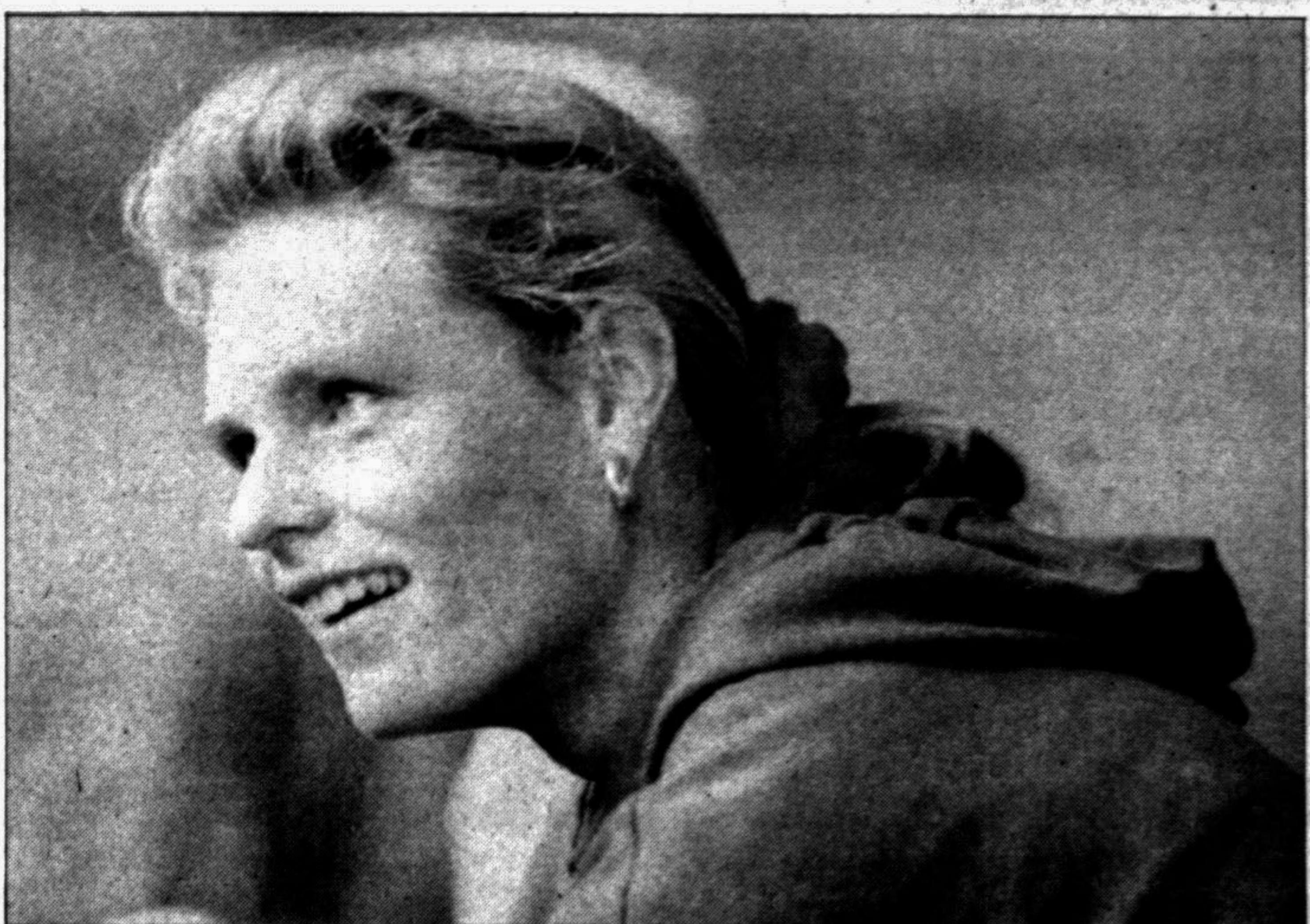
An AFP file photo dated February 1992 of former German double sprint champion Katrin Krabbe whose two-year ban for doping was overturned by a court in Berlin yesterday.

About eight teams drawn from different naval ships and establishment will take part in the five-day meet.