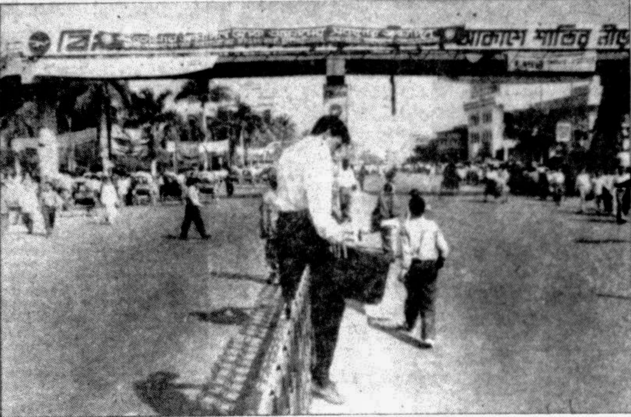
Lack of proper road sense among the public, as seen here, is one of the major reasons behind the acute traffic problem in the capital. Very few people use the overbridges or the zebra crossings despite repeated media campaigns by the authorities.