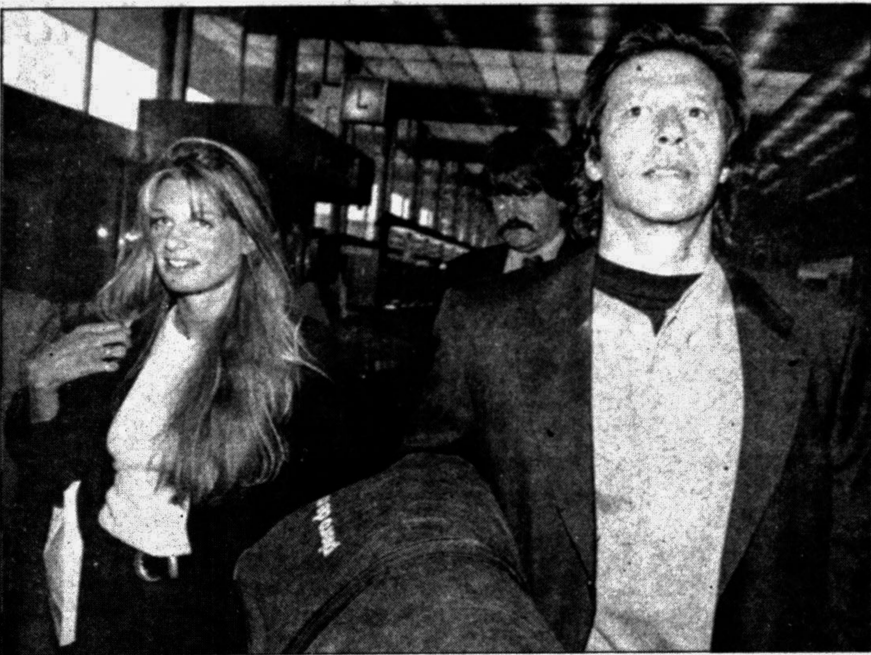
Imran Khan, the former Pakistan skipper and the heartthrob of millions on the distaff side arrives at Paris' Orly Airport on Monday along with his fiancée Jemima Goldsmith to seek some privacy. The 42-year-old cricketer hero has decided to marry Jemima, 21, the daughter of Franco-British millionaire Sir Jimmy Goldsmith. The walimah is scheduled to be held in London on June 20.