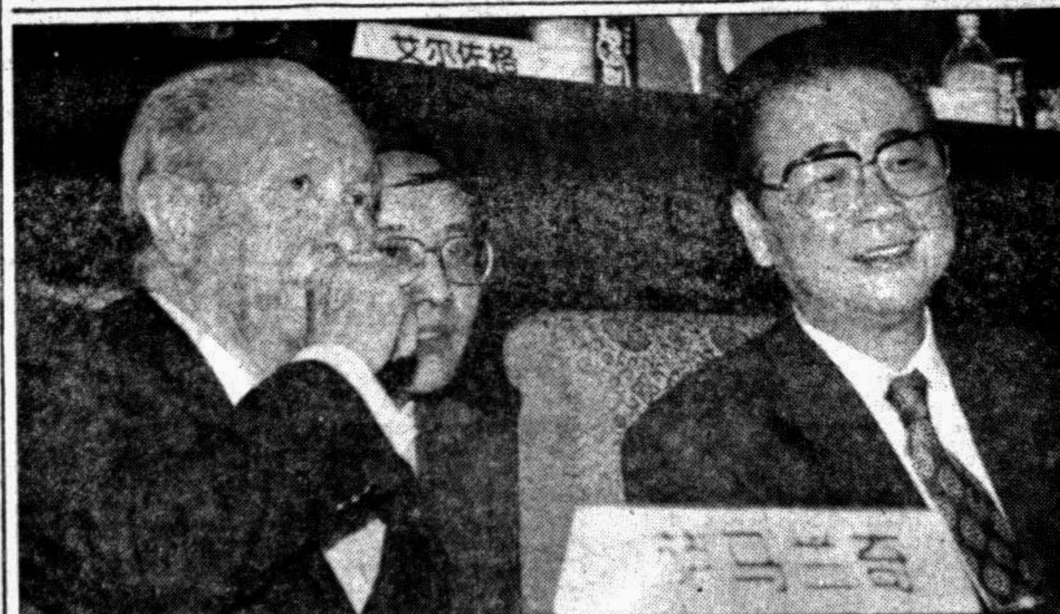
The International Olympic Committee (IOC) president Juan Antonio Samaranch (L) chats with the Chinese Prime Minister Li Peng prior to the start of men's singles final of the 43rd World Table Tennis Championships in Tianjin on Sunday.