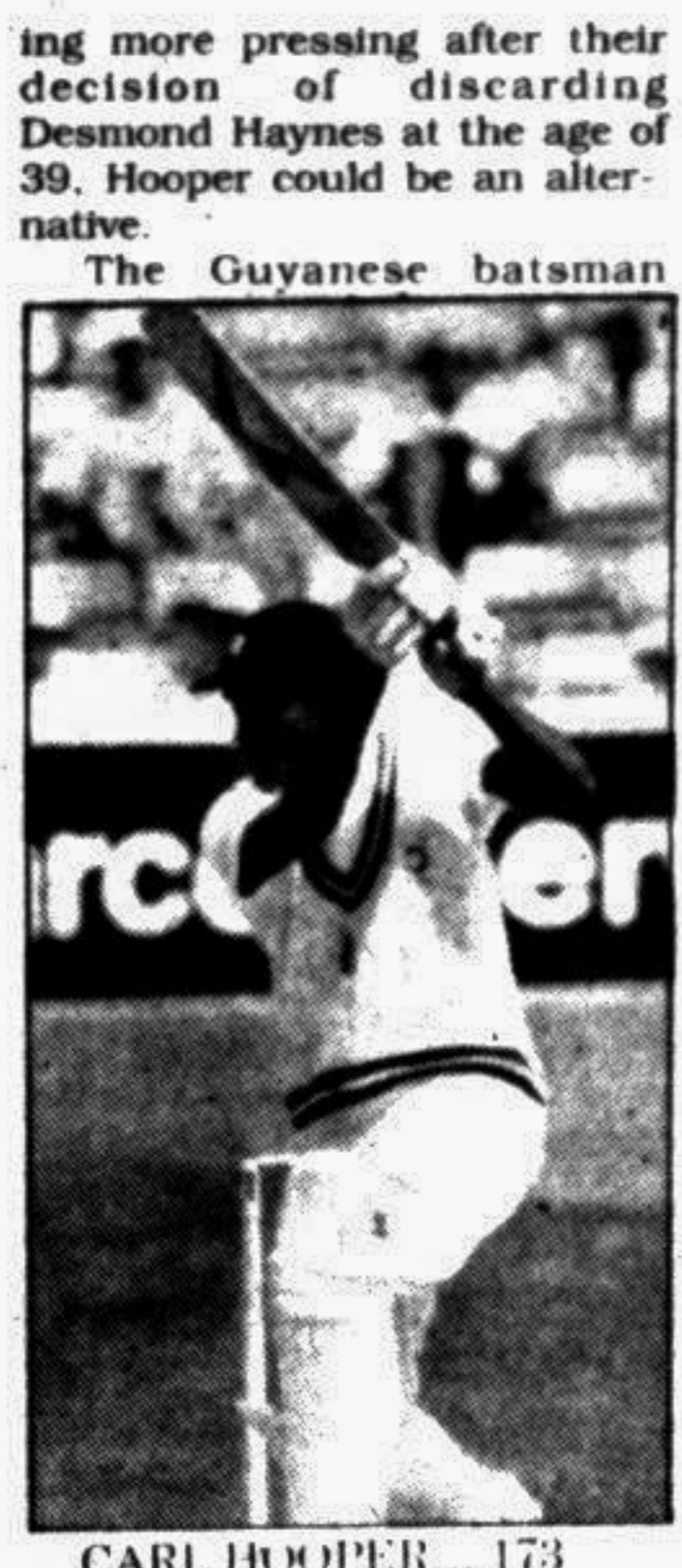
CARL HOOPER... 173

ARUNDEL, England, May 14: Carl Hooper launched West Indies' tour of England by lashing an unbeaten 173 from 140 balls in the unfamiliar role of opener on Saturday, reports Reuter. Hooper's exhilarating innings, containing nine sixes and nine fours, set up West Indies for a 102-run victory in their one-day match against the Duchess of Norfolk's XI. West Indies piled up 298 for three from their 50 overs and the Duchess team, limited by county commitments to just two players currently earning a living from first-class cricket, made 196 for eight in 50 overs. Even though the opposition attack was modest, Hooper looked in wonderful touch as he sped to the highest individual score in the history of the fixture which has been a traditional tour curtain-raiser since the 1950s. With West Indies' search for a new opening pair becoming