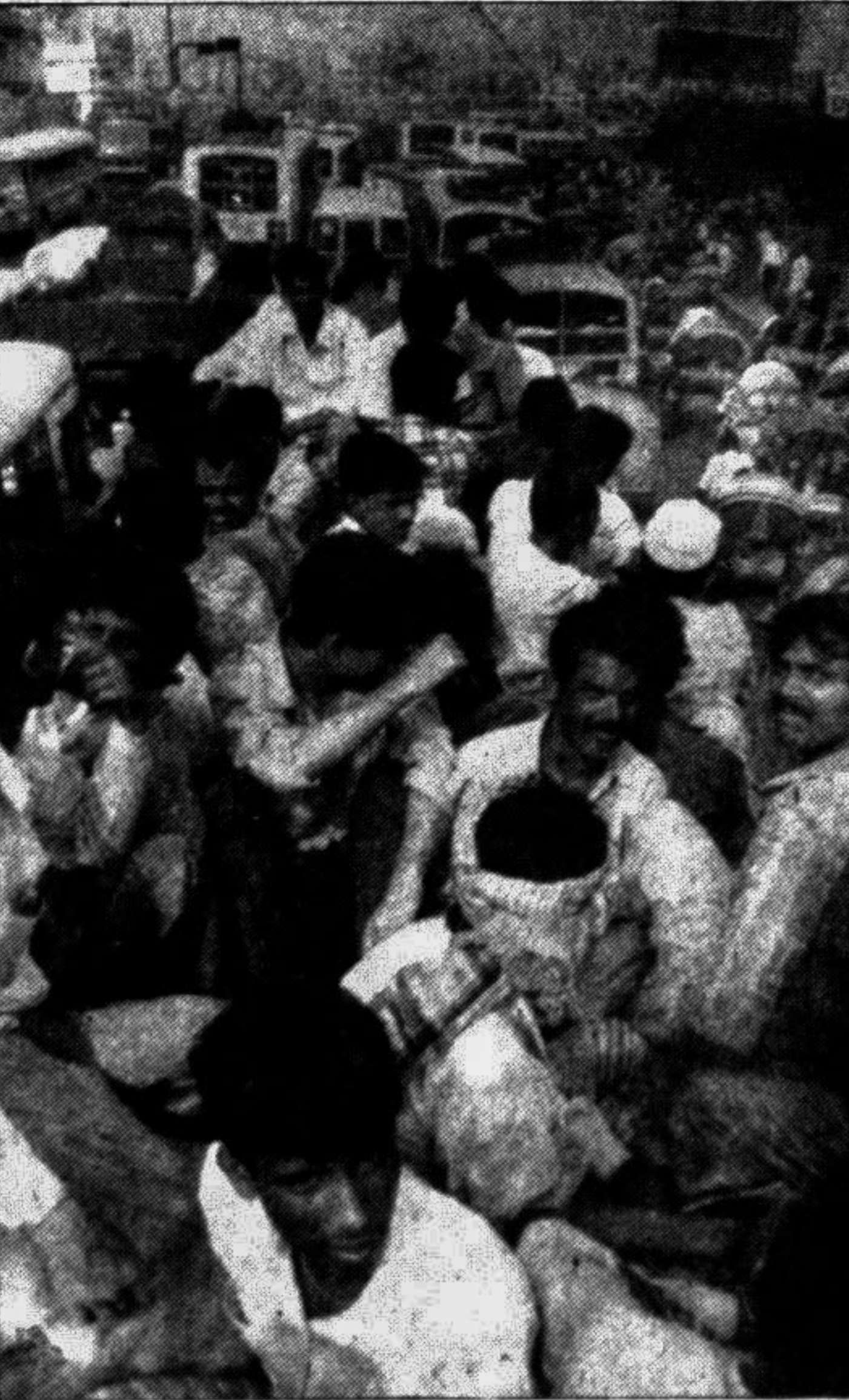
Home-bound passengers sit on the rooftop of a bus in their mad rush to celebrate Eid-ul-Azha with their near and dear ones. This picture was taken yesterday.