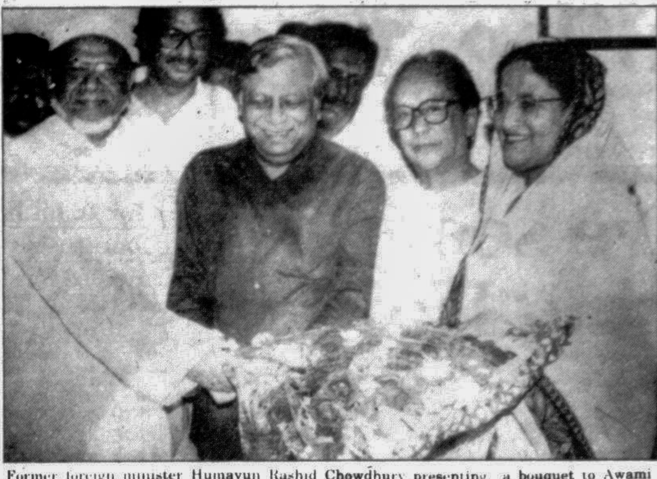
Former foreign minister Humayun Rashid Chowdhury presenting a bouquet to Awami League chief Sheikh Hasina. The former FM joined Awami League on Sunday.

Ministry with Minister Muhamamad Keramat Ali in the chair. The Eid-ul-Azha will be celebrated on Thursday (May 11) throughout the country as per decision of the Moon Sighting Committee.