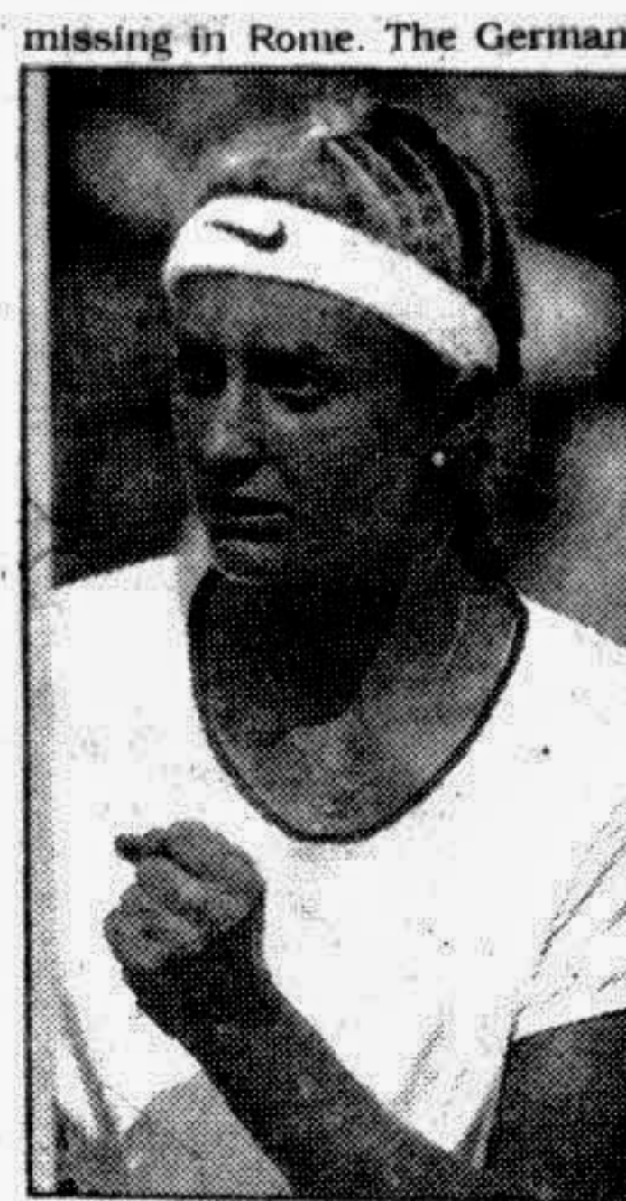
MARY PIERCE took the title in 1987 but has

Top ranked Steffi Graf is now the only women from the world's top four who will be