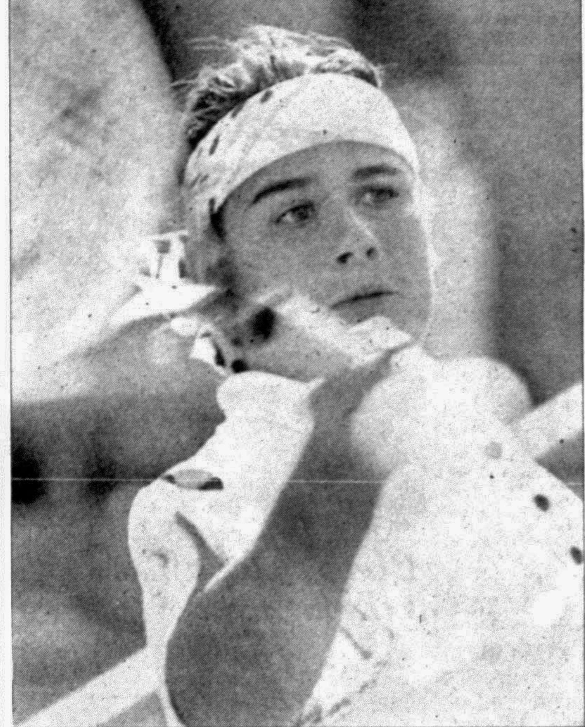
Spanishiard Conchita Martinez plays a forehand return against Bulgarian Magdalena Maleeva during their semifinal match at the Hamburg Open on Saturday. Martinez won 6-0, 6-0.