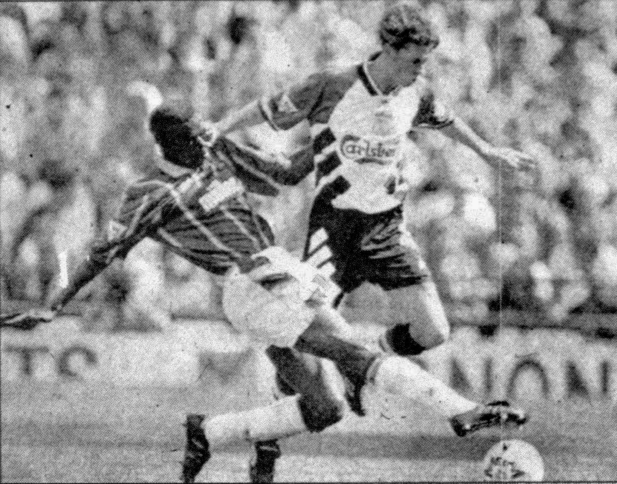
Liverpool's Steve McManaman (R) and Ian Wright of Aston Villa try to take control of the ball during their English Premier League match at Villa Park in Birmingham on May 6. Villa won the match 2-0.

a goal drought of three matches with two in the 2-1 home victory over Tottenham. Rangers manager Ray Wilkins said he was determined to keep hold of Ferdinand. He also revealed that negotiations to sign Paul Gascoigne have already begun with Lazio. Wilkins said: "Les showed his class. He is the cream and, as they say, cream always rises to the top." "I want to keep Les here. I'll be sitting down with Les to see what his plans are in the next couple of weeks." "He's an ambitious man but hopefully the owner of this