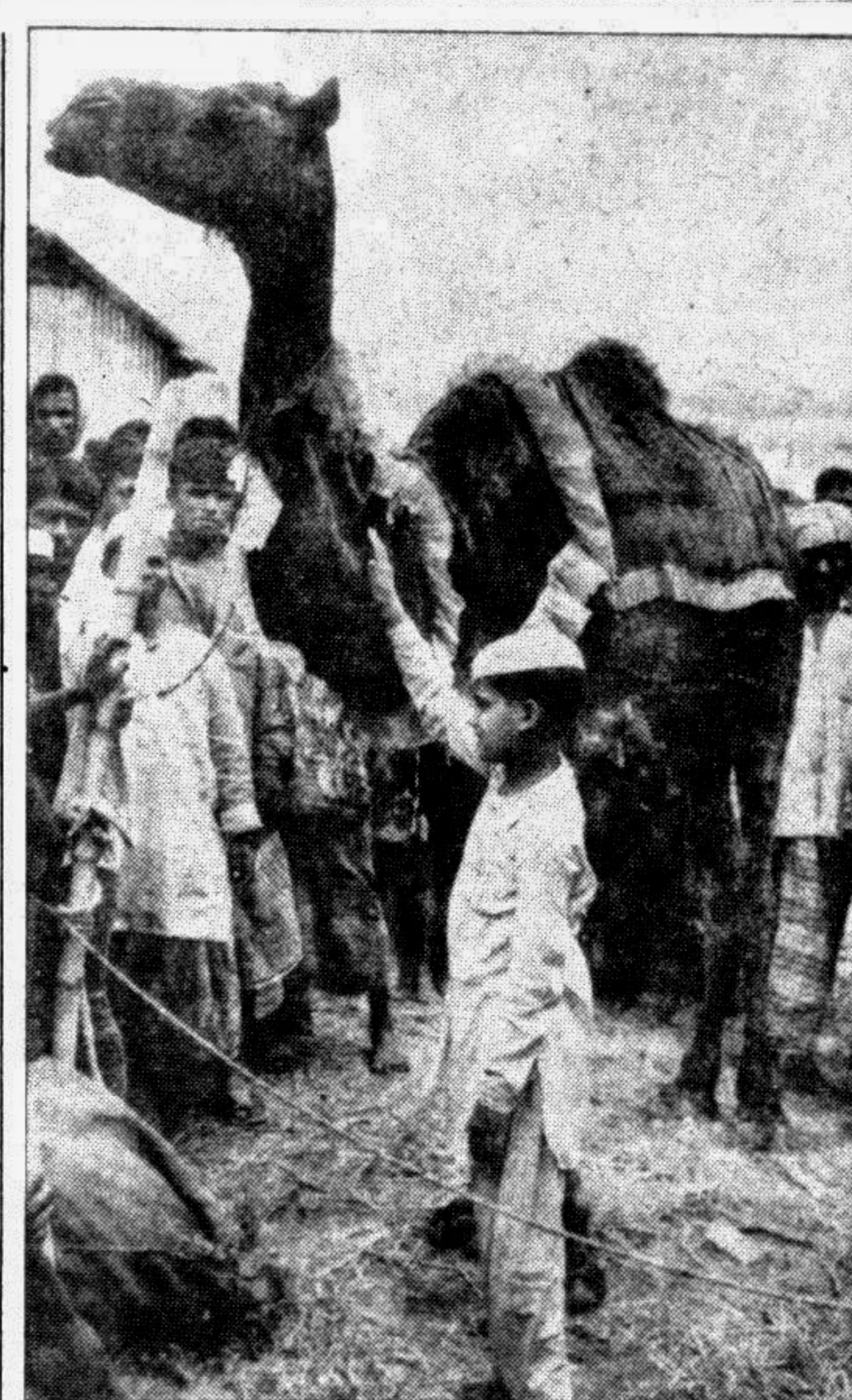
This camel purchased from across the border at Hili in Dinajpur district was brought to the city's Gabtali cattle market as a sacrificial animal for Eid-ul-Azha. Its owner was demanding exorbitant price of Tk 2.60 lakh.