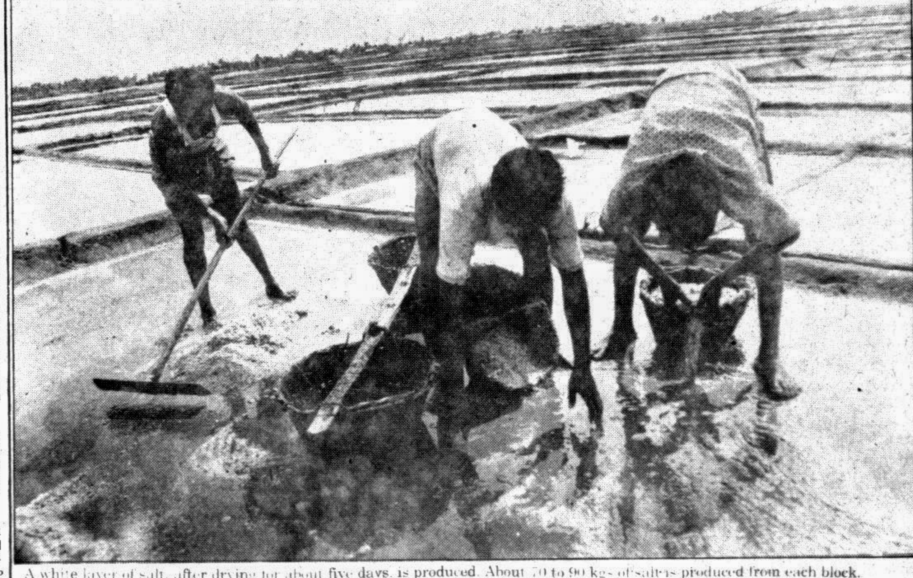
A white layer of salt, after drying for about five days, is produced. About 70 to 90 kg of salt is produced from each block.