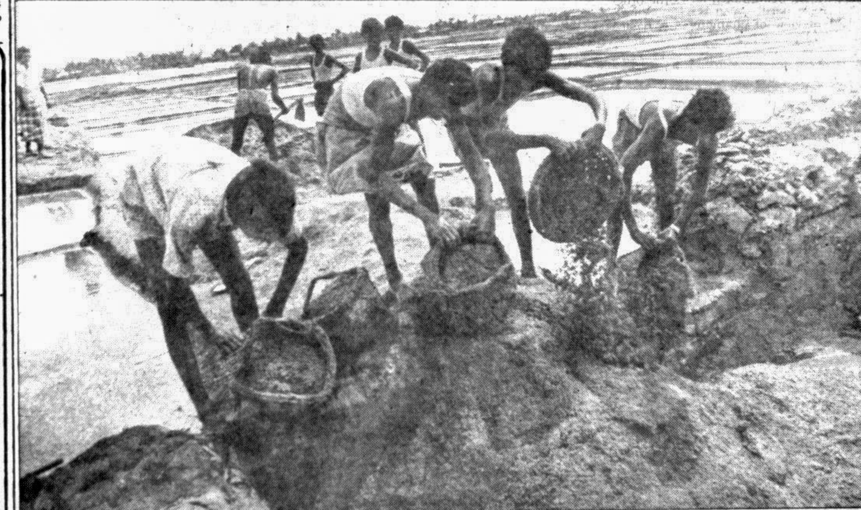
After processing, the salt is stored underground.