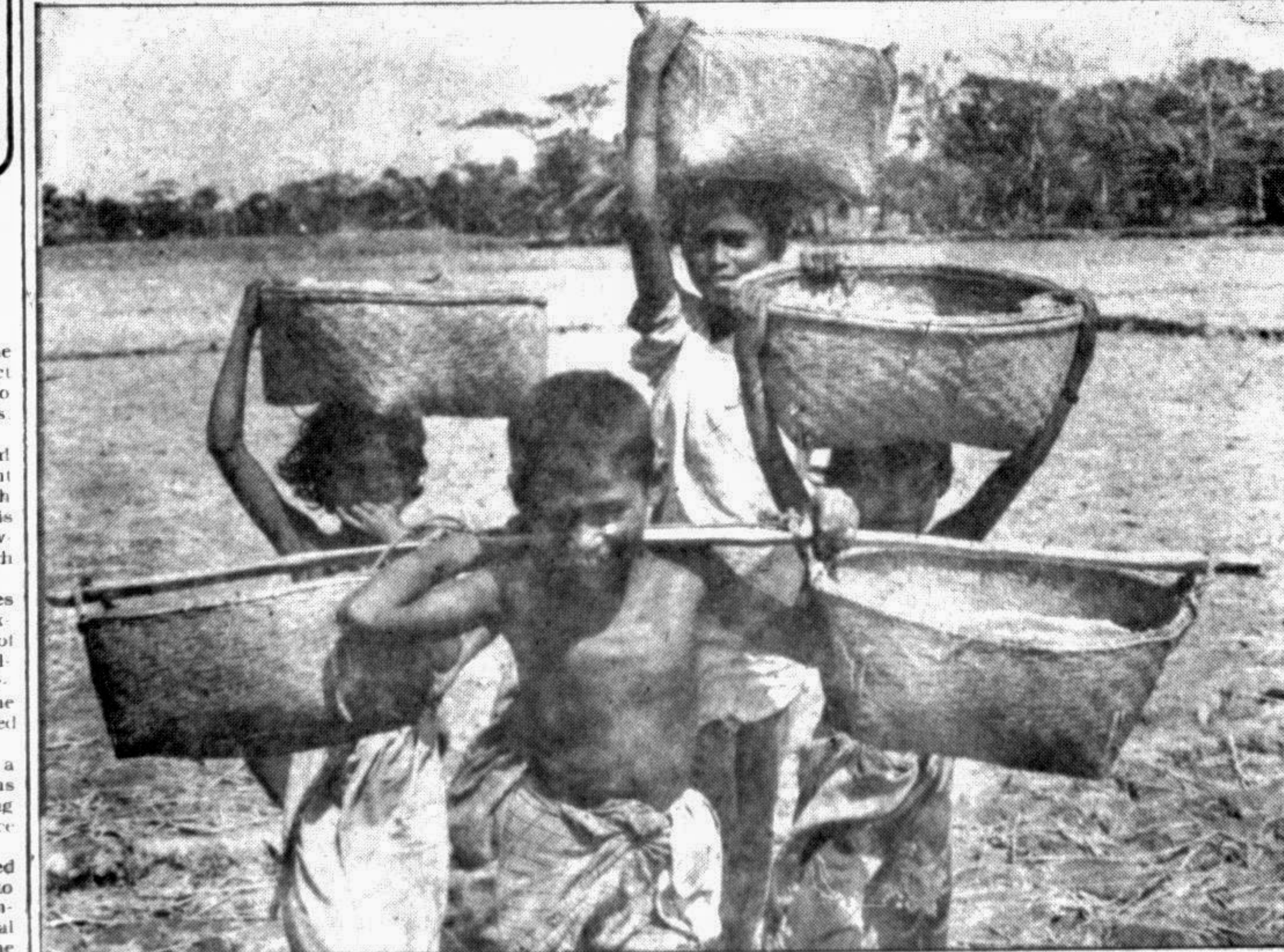
Salt carried in bamboo made baskets are being sent to markets for selling.